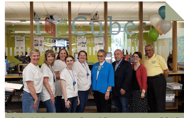
iCube Makerspace Grand Opening - June 2019