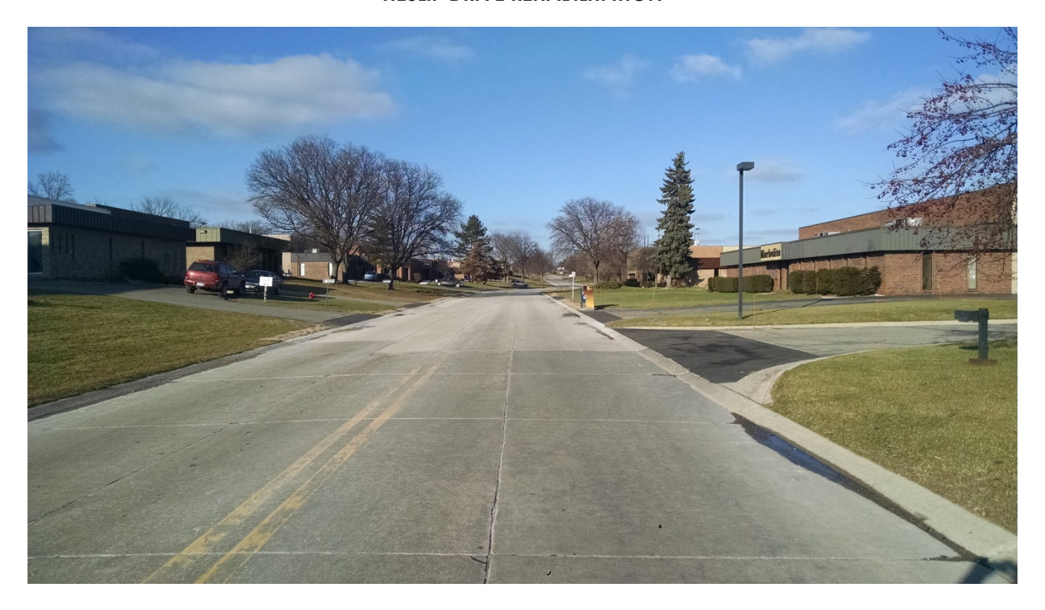
Heslip Drive - Looking north from 9 Mile