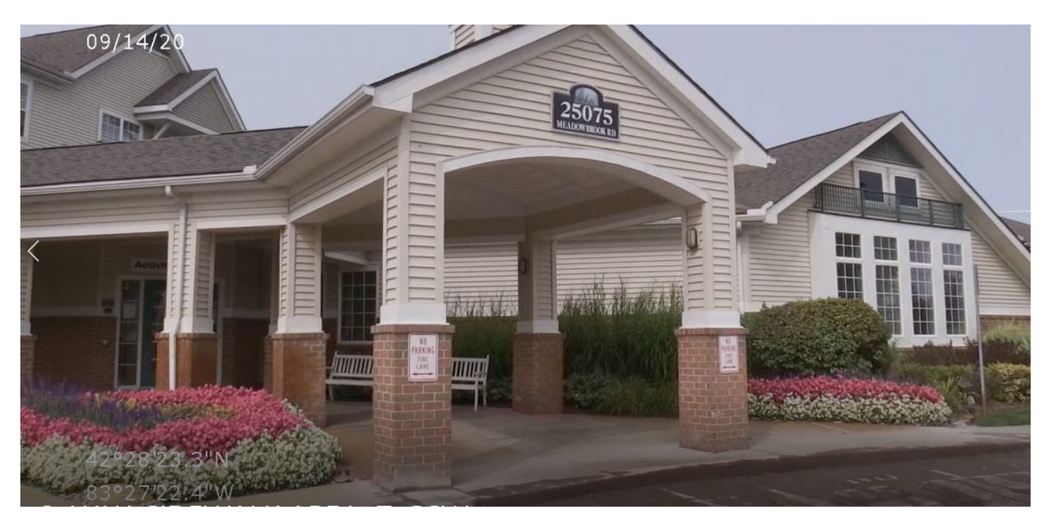
Meadowbrook Commons - Entrance ramp prior to work being done