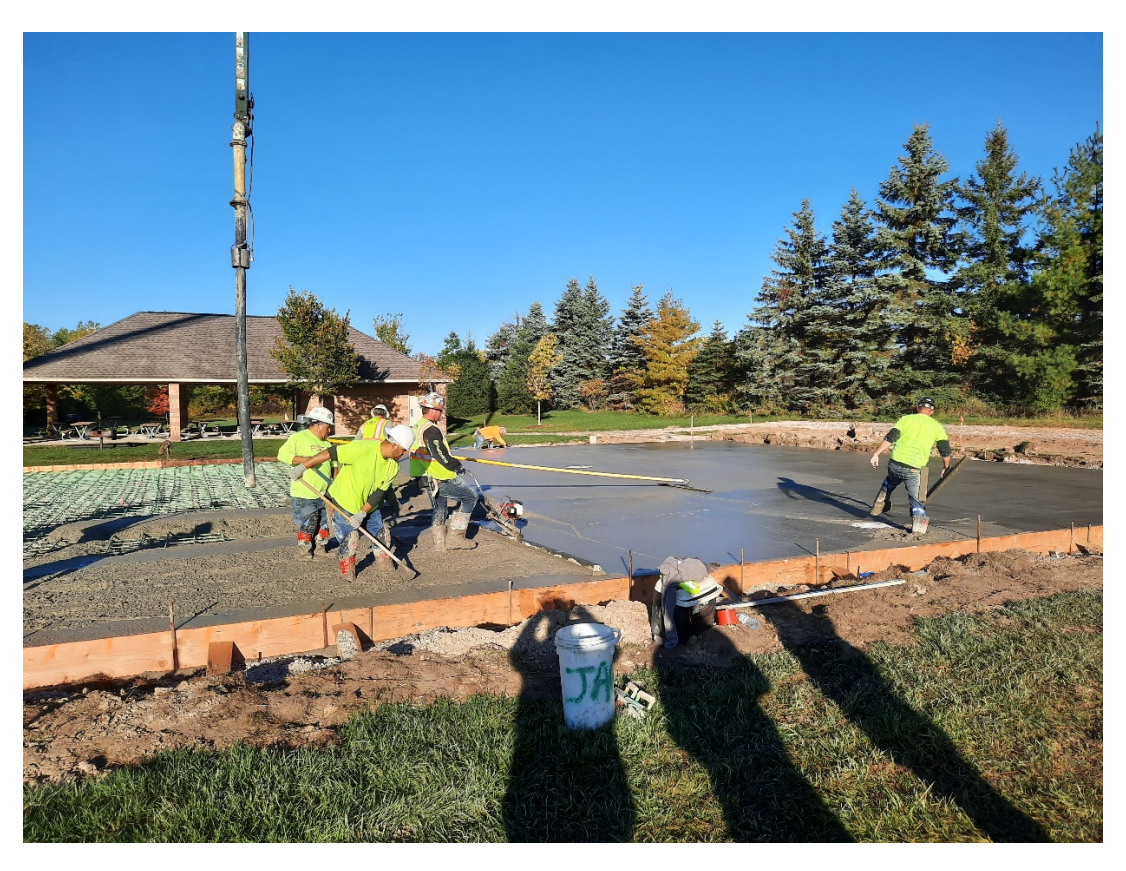
Pickleball Courts - Formed and poured with fresh concrete at north end.