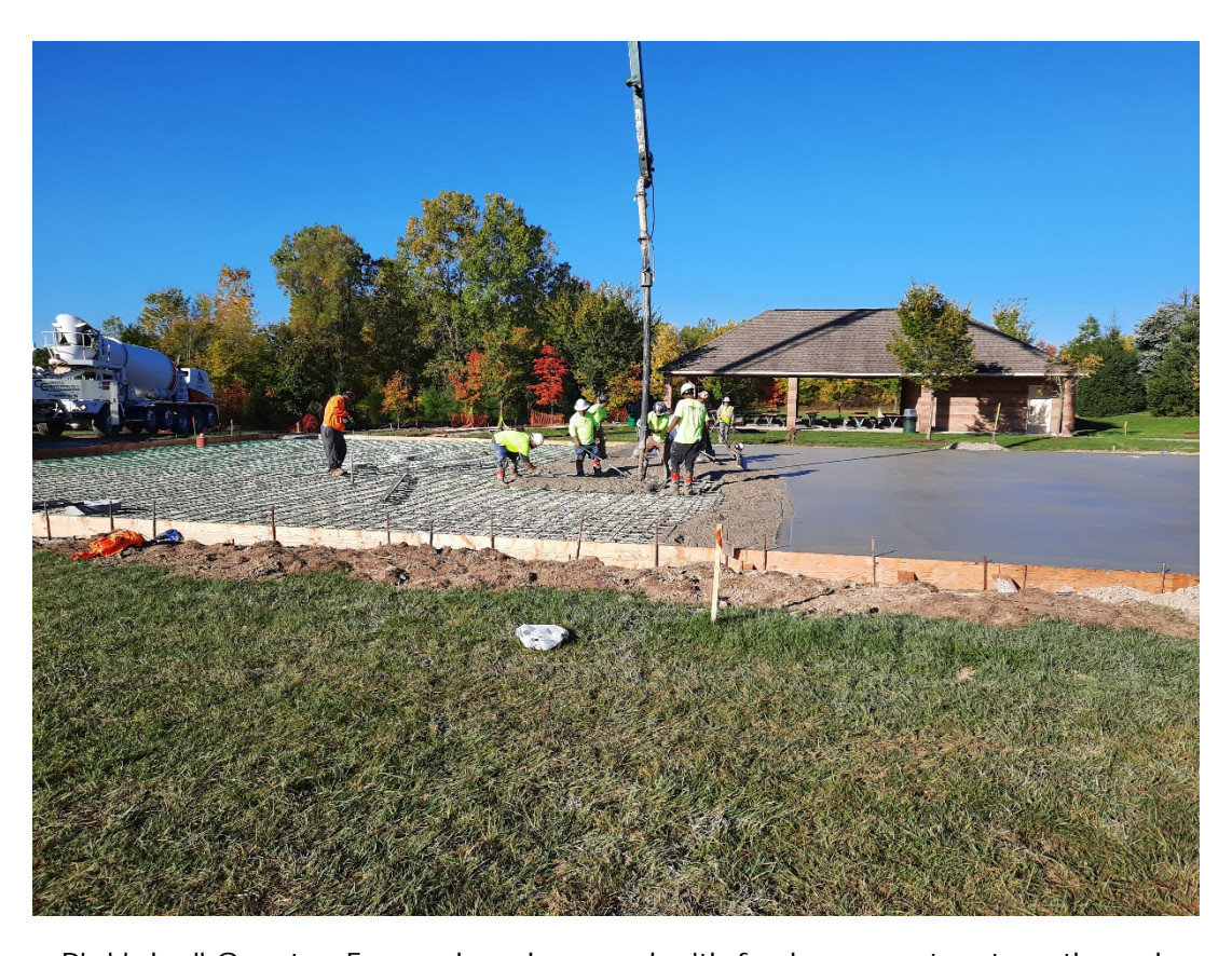
Pickleball Courts - Formed and poured with fresh concrete at south end.