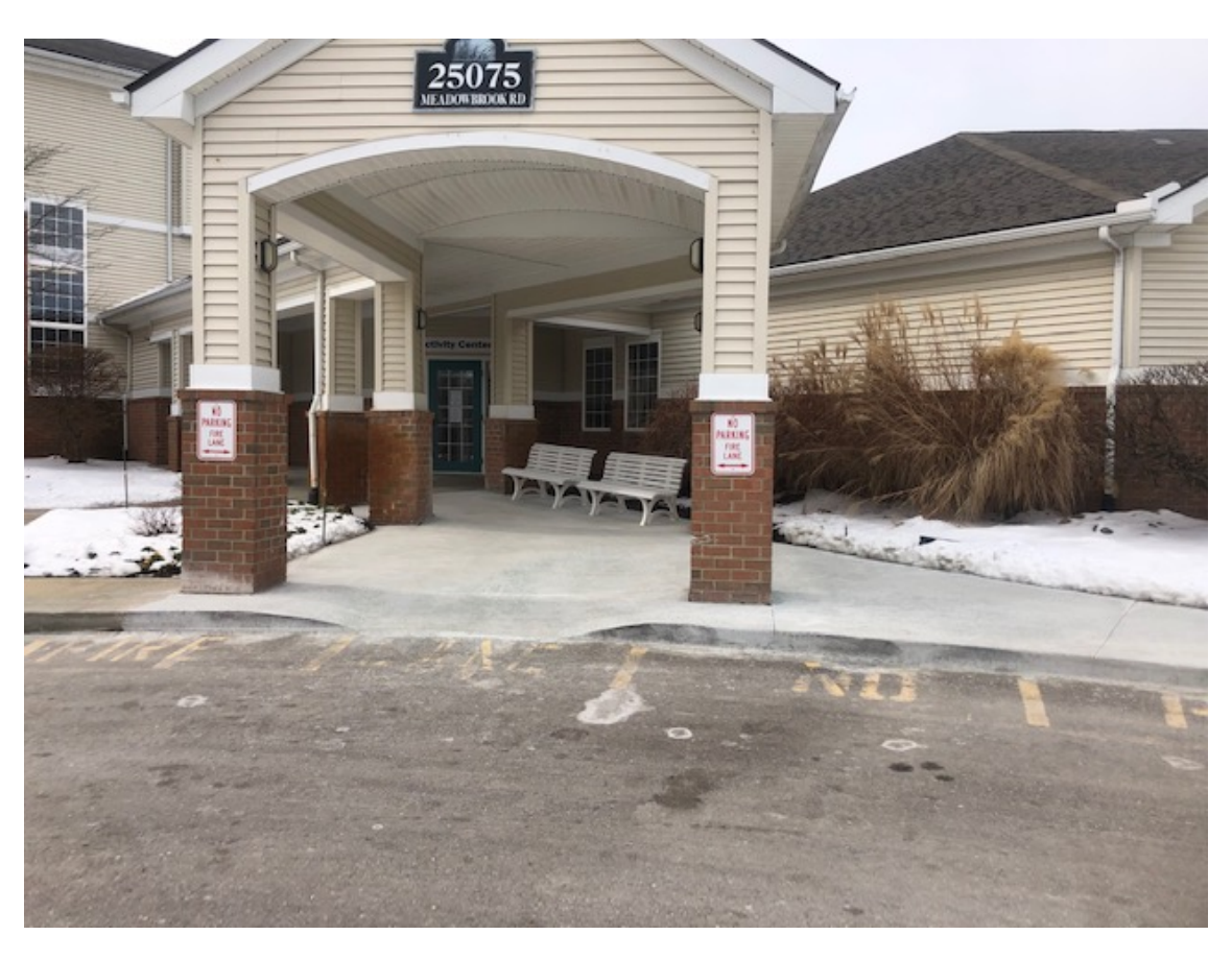
Meadowbrook Commons - Entrance ramp after work was completed