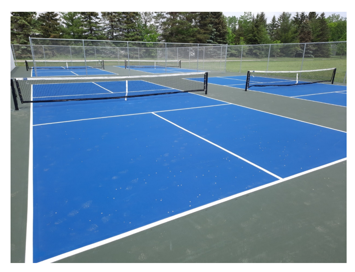
Pickleball Courts - Close-Up of Finished Product