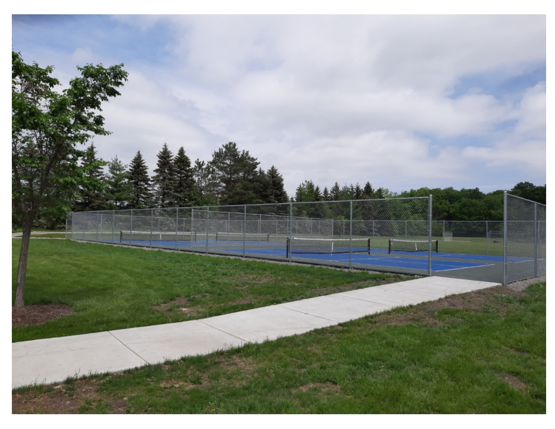
Pickleball Courts - Overall