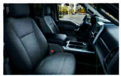
XLT SuperCab cloth-trimmed interior in Medium Earth Gray with XLT Premium Package, 40/console/40 front bucket seats and available equipment.