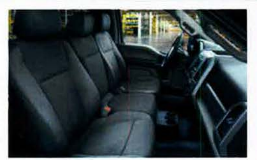
XL Regular Cab cloth-trimmed interior in Dark Earth Gray with XL Value Package, 40/20/40 split front seat and available equipment.