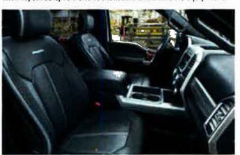
PLATINUM Crew Cab leather-trimmed interior in Black with 40/console/40 front bucket seats and available equipment.