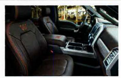
KING RANCH Crew Cab leather-trimmed interior in Mesa Brown with 40/console/40 front bucket seats and available equipment.