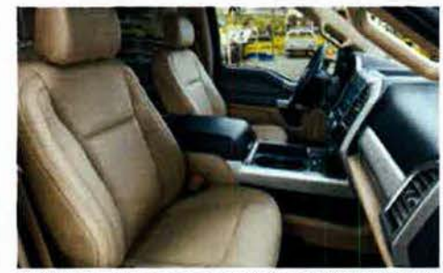
LARIAT Crew Cab leather-trimmed interior in Medium Light Camel with 40/console/40 front bucket seats and available equipment.