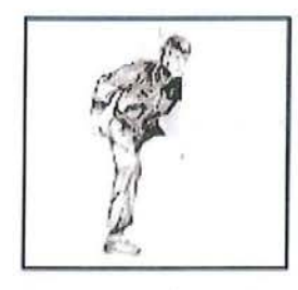
The Novi Police Department requests that you call Crime Stoppers at 1-800-SPEAK-JP with any information that you have regarding a burglary in your neighborhood. You will remain <u>ANONYMOUS</u> and there is a reward if this information leads to the arrest of the suspect (s) responsible for this crime.