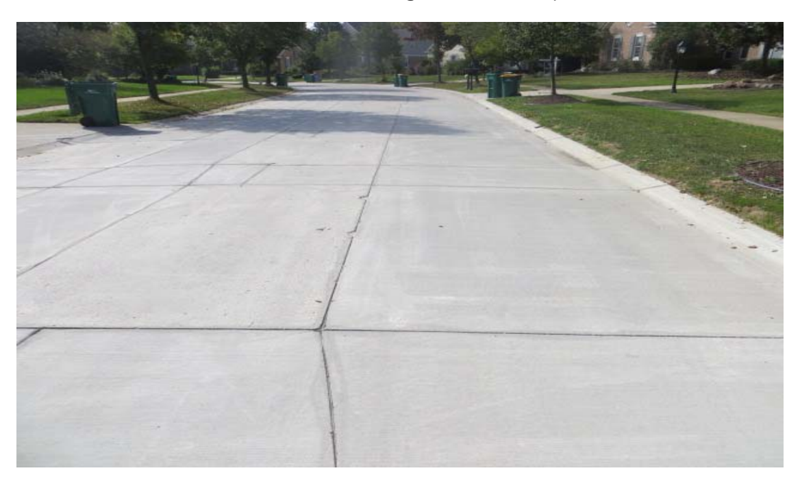
Fairway Hills Drive looking North after repairs