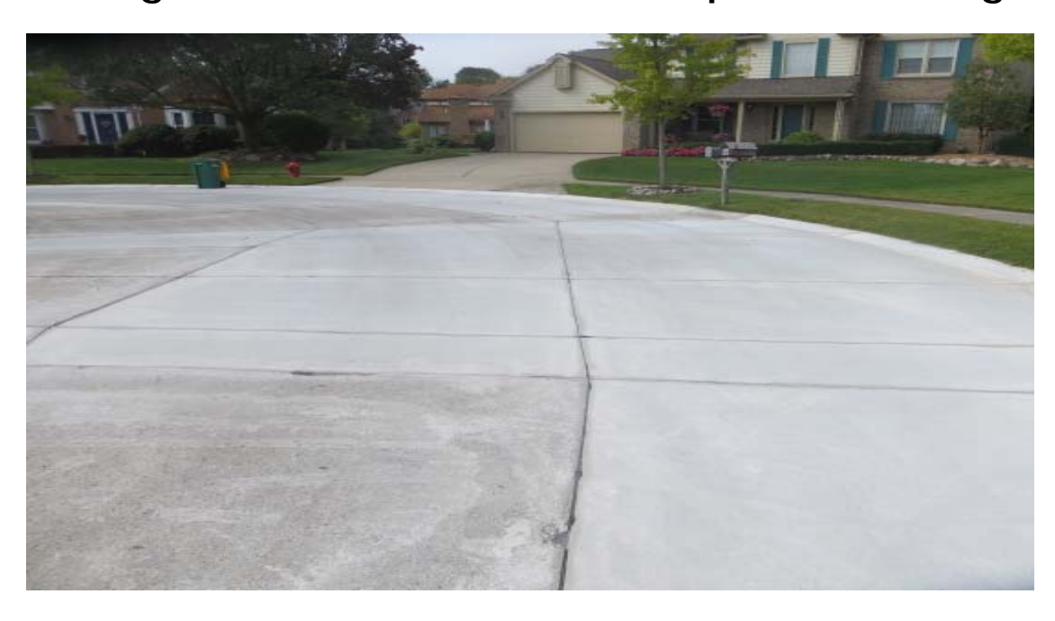
Simmons Drive looking North after repairs