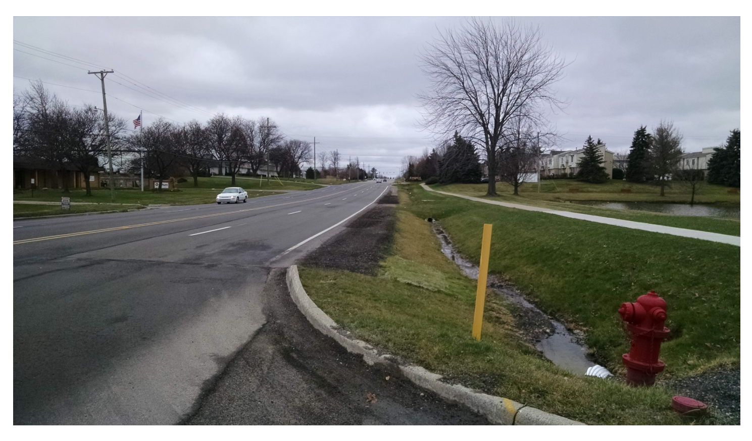
Looking south along road widening and gravel shoulders