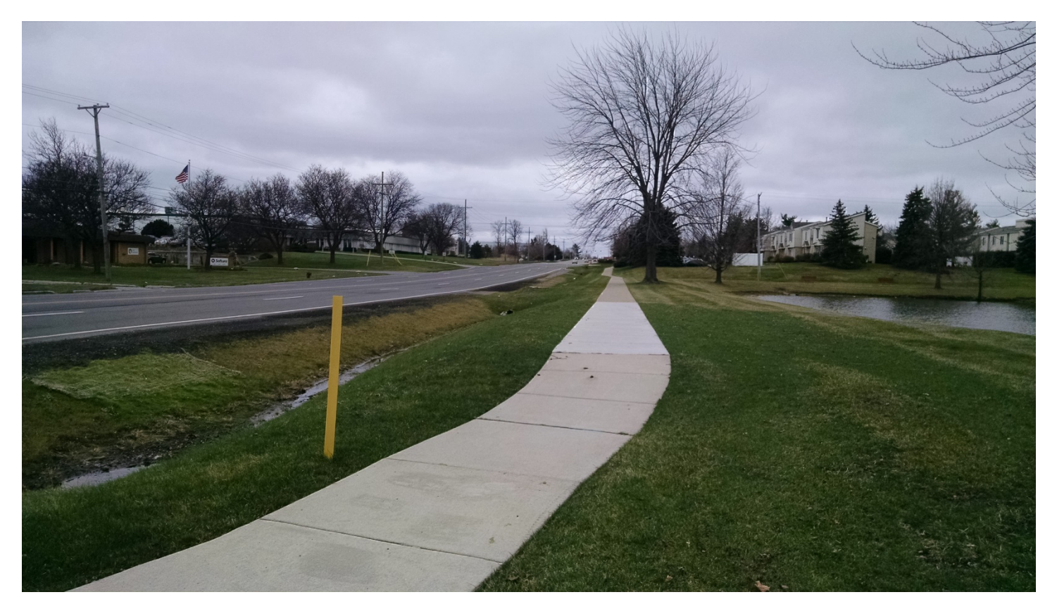
Looking south along sidewalk and ditch line improvements