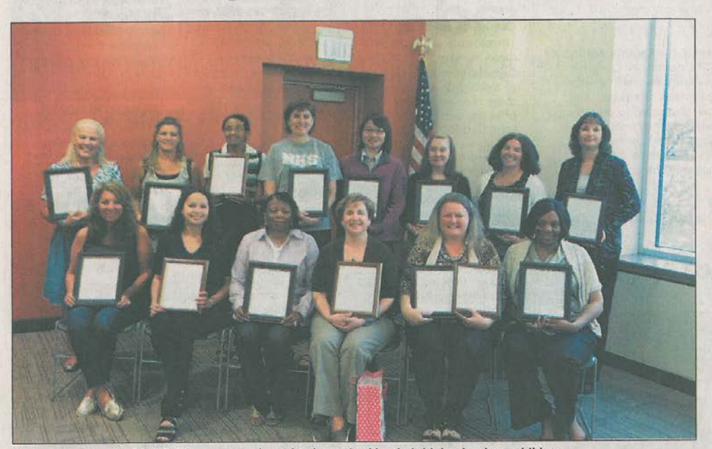
The moms at the Novi Public Library were pleased to be praised by their high school-age children.