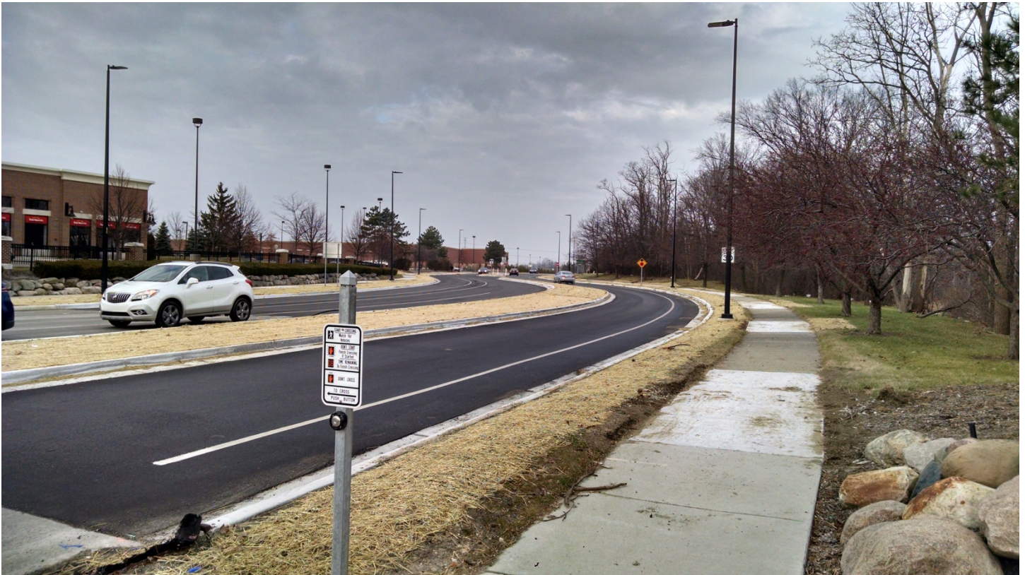
Northbound Town Center Drive from Grand River, looking north