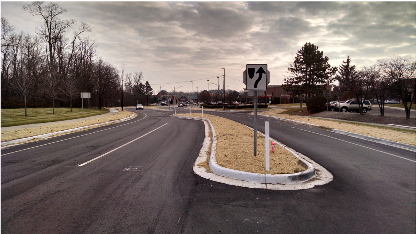
Town Center Drive at 11 Mile, looking south