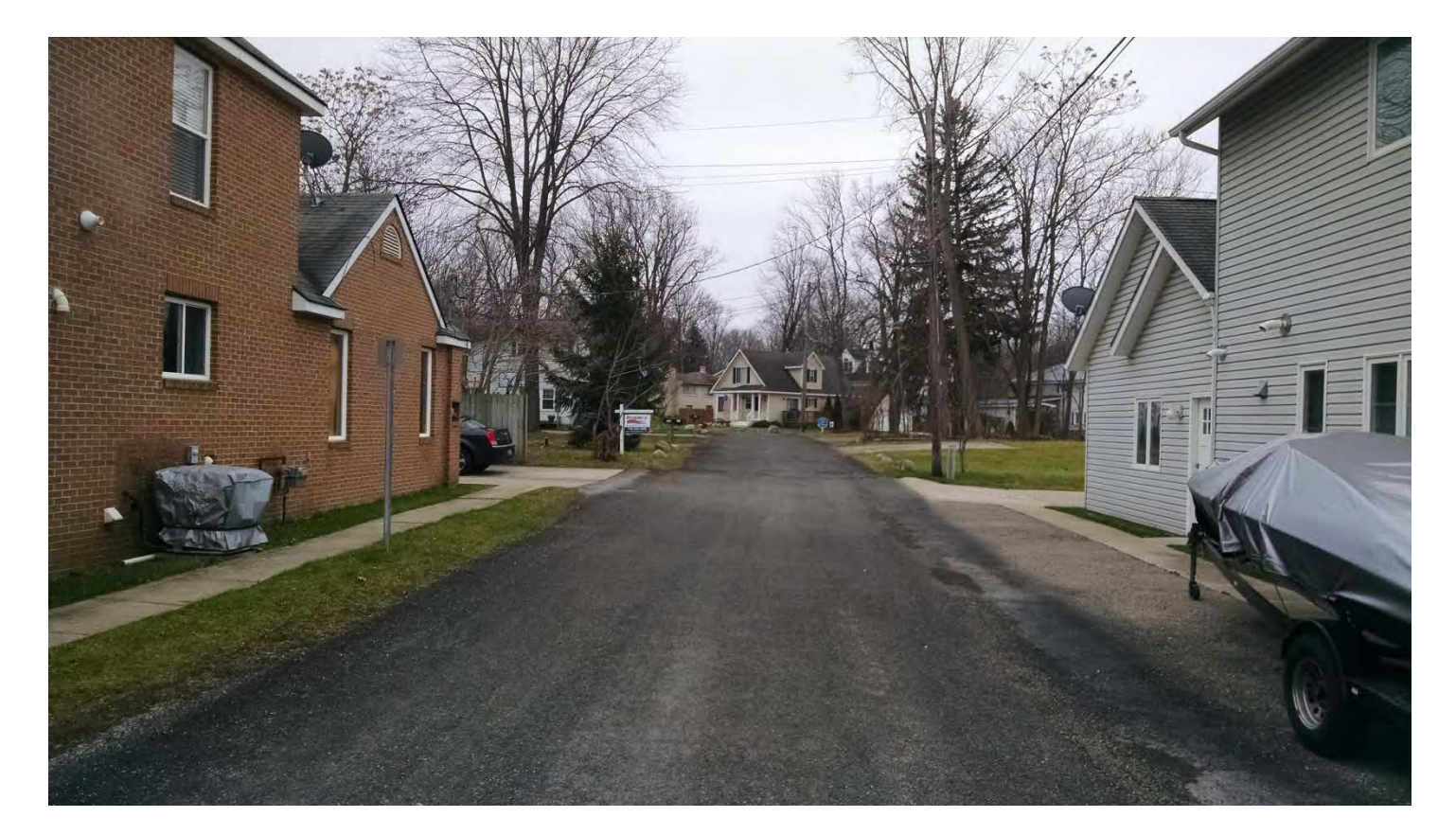
Eubank Street – Looking south