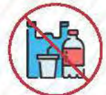
Plastic (including plastic bags, plastic wrap, silverware, straws, bottles)