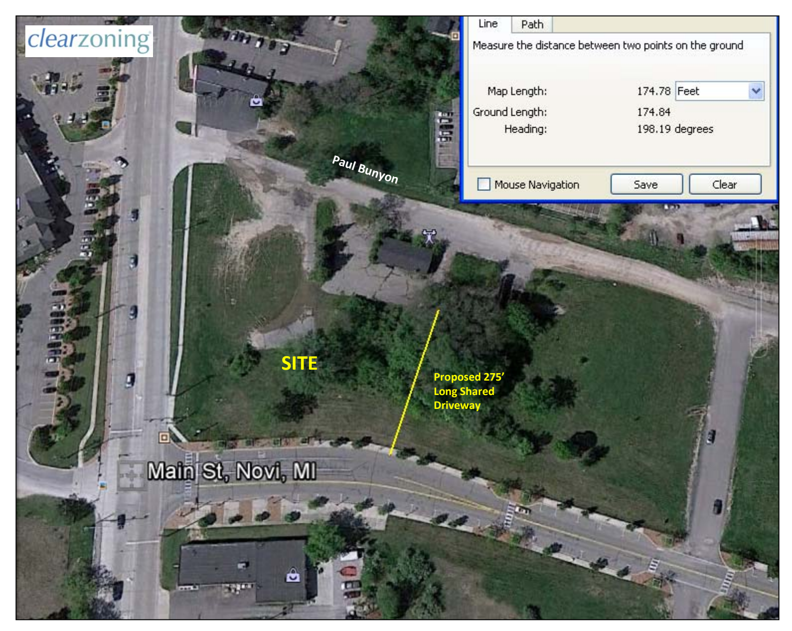
Vicinity Aerial Photo for Proposed Detroit Metropolitan Credit Union