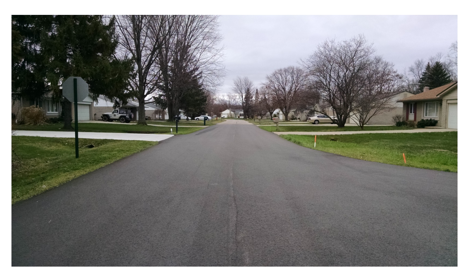
West LeBost Drive – Looking south.