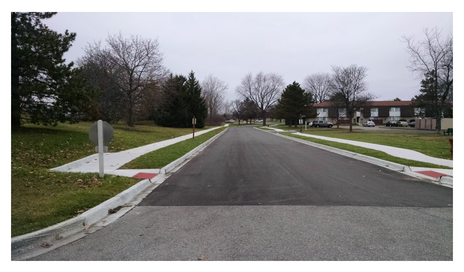
Wedgewood Drive – Looking north from Springlake Boulevard.