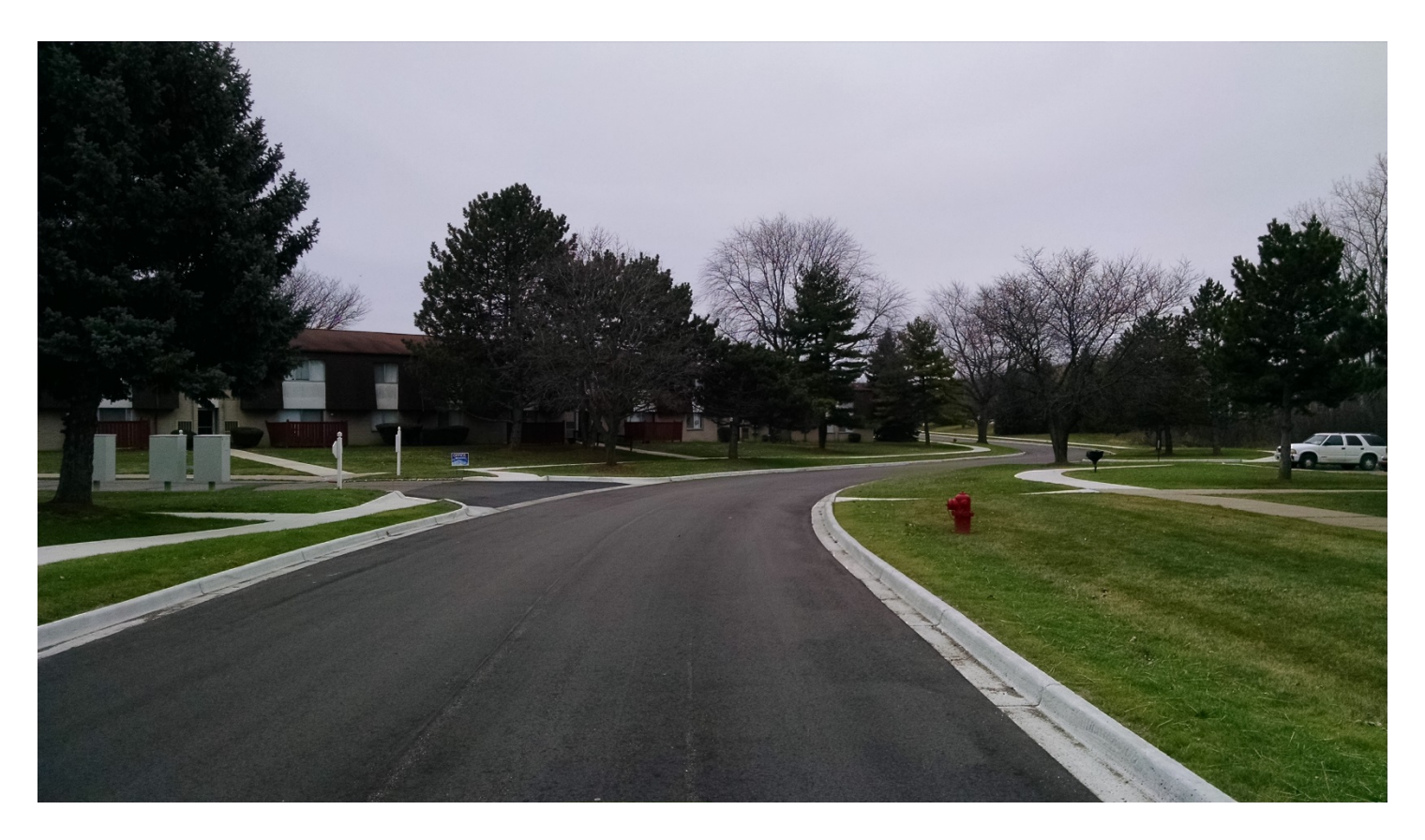
Wedgewood Drive – Looking south