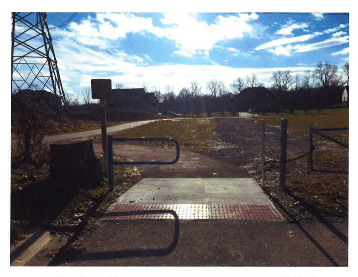
Pathway spurs to and from the new ITC Trail at Park Place and Deer Run.