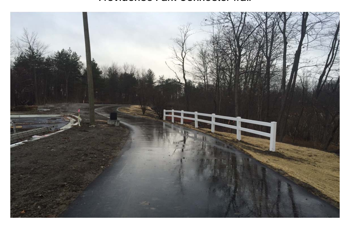
Looking west along path at northwest corner of the Erickson Senior Living facility.