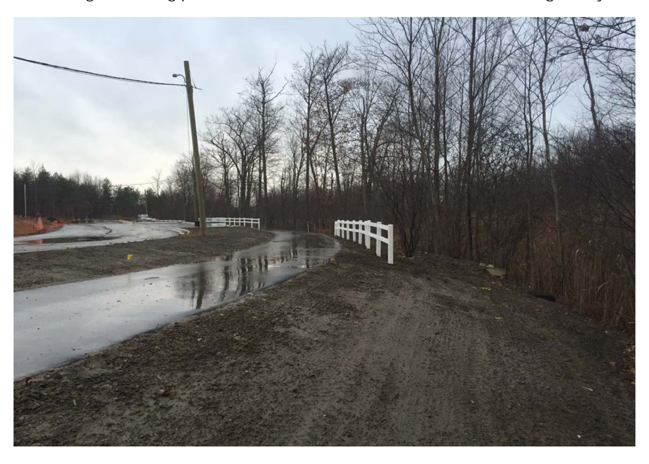
Looking west along new path, just west of Xavier Way.