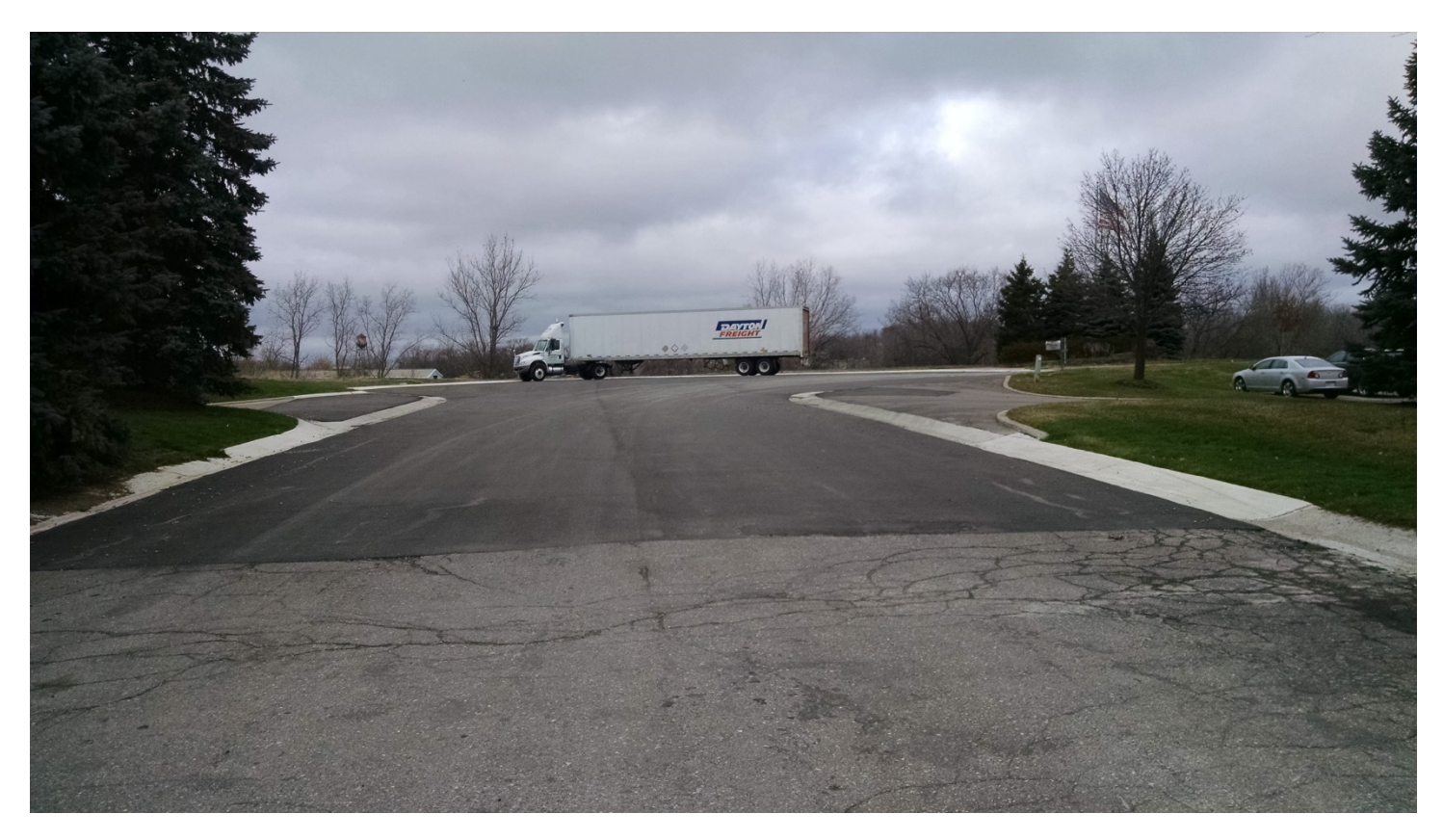
South of cul-de-sac, looking north