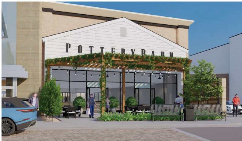
Figure 8: Pottery Barn Façade Rendering, as provided by the applicant

Approval at the request of Ashley Montague of Rebecca Olson Architect, LLC, on behalf of Pottery Barn, for a Section 9 Façade waiver. The subject site is on a portion of the 18.74-acre parcel located at 27500 Novi Road at Twelve Oaks Mall (Section 14). The site is zoned R-C: Regional Center. The applicant requests approval to paint the existing brick on the east (front) façade of the former California Pizza Kitchen space as part of the Pottery Barn storefront modification.