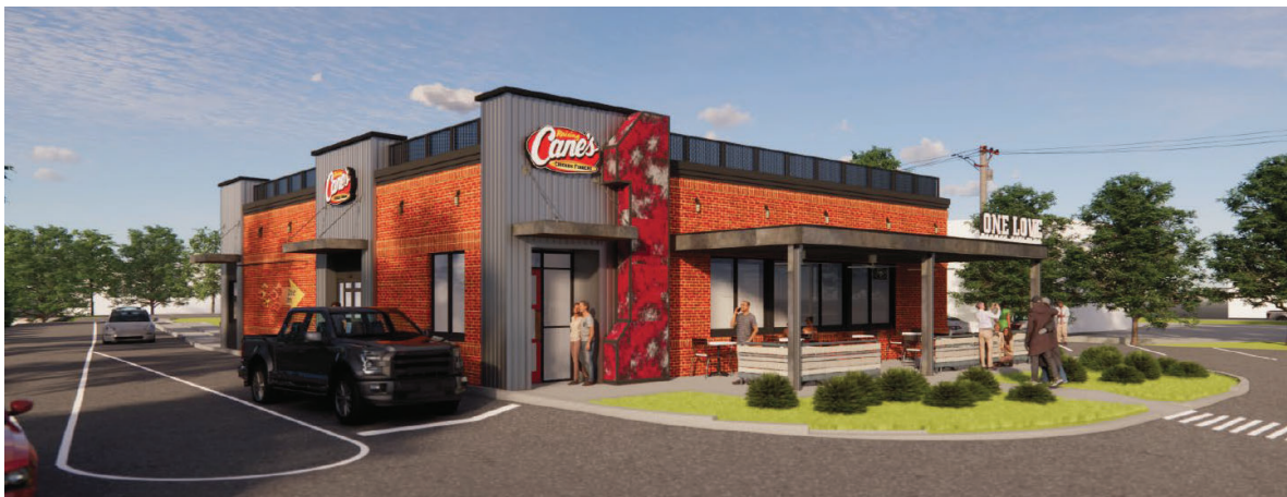
Figure 5: Raising Cane's Rendering, as provided by the applicant

Public Hearing at the request of Raising Cane's to consider Special Land Use and Preliminary Site Plan approval to convert a former Wendy's to a Raising Cane's restaurant. The applicant is proposing modifications to accommodate improved drive-through and by-pass lanes, modifications to the building façade, and providing covered patio seating. The subject property is within the TC, Town Center Zoning District, which lists Fast Food Drive-Through Restaurants as a Special Land Use.