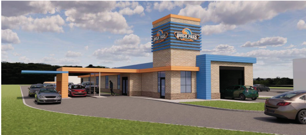
Figure 1: Quick Pass Car Wash Rendering, as provided by the applicant