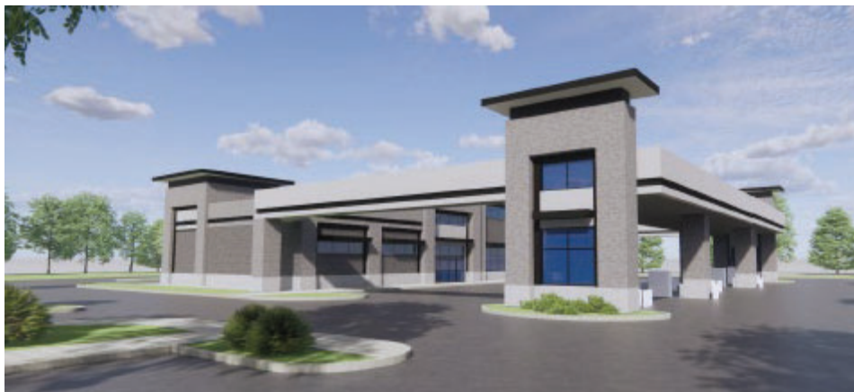
Figure 7: Grand-Beck Development Rendering, as provided by the applicant

Public hearing at the request of Gratus, LLC for consideration of Preliminary Site Plan, Wetland Permit, Woodland Permit, and Stormwater Management Plan. The subject properties, located at 47277 Grand River Avenue, comprise approximately 3.70 acres. The site is located east of Beck Road, south Grand River Ave (Section 16), and is zoned B-3 District. The applicant proposes to develop the site with a fuel station, convenience store, and car wash.