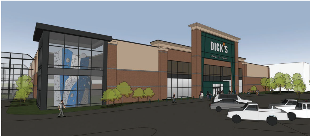
Figure 3: Dick's House of Sport Rendering, as provided by the applicant

Public hearing at the request of Dick's Sporting Goods for Planning Commission's recommendation of a Special Land Use Permit and Preliminary Site Plan. The subject property at 27600 Novi Road totals approximately 17.79 acres and is located east of Novi Road, south of Twelve Mile Road (Section 14). The property is zoned R-C (Regional Center District). The applicant is proposing to occupy a portion of the existing 241,725 square foot building and construct an outdoor track/field area adjacent to the building.