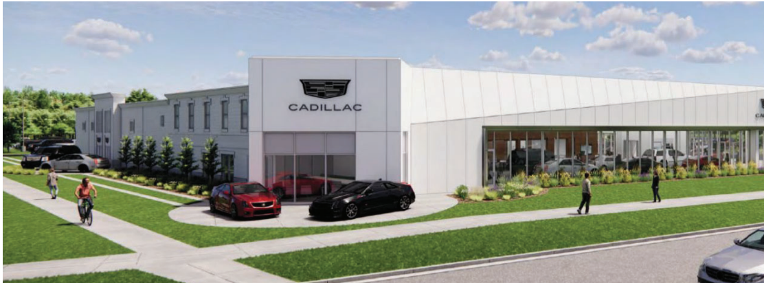
Figure 4: Cadillac of Novi Rendering, as provided by the applicant