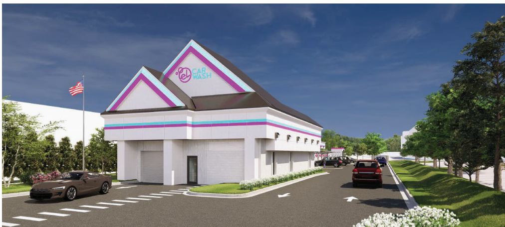
Figure 2: El Car Wash Rendering, as provided by the applicant

Consideration of El Car Wash Novi II for Preliminary Site Plan approval. The subject property is 0.54 acres in size, is zoned TC Town Center District, and is located on the east side of Novi Road, north of Grand River. The applicant is proposing to reutilize the existing car wash building for a new car wash.