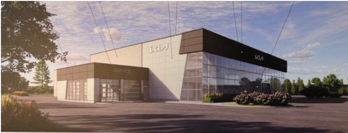
Figure 6: Feldman Kia Rendering, as provided by the applicant