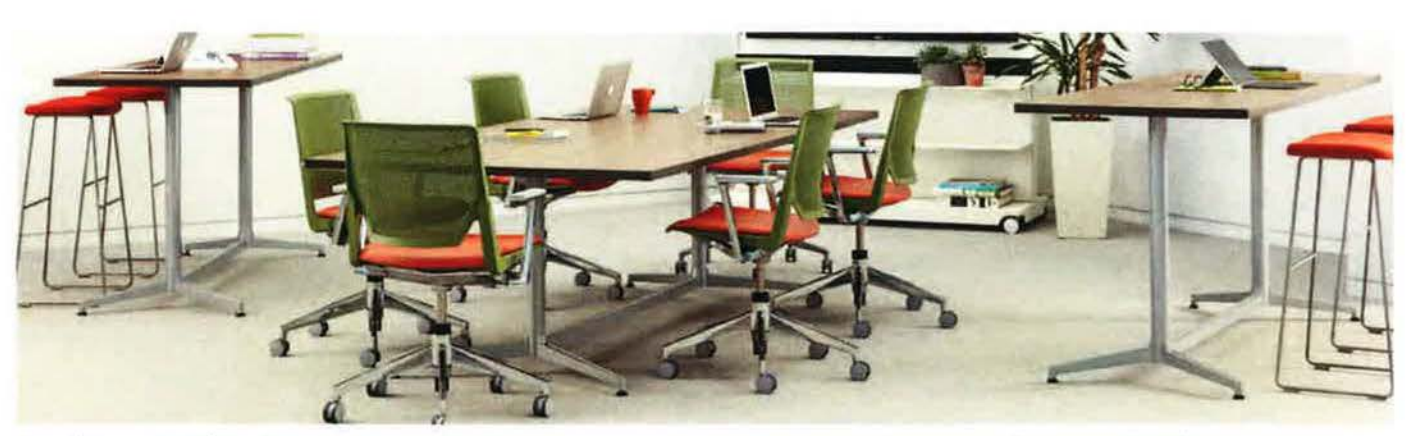
Live offers a variety of top shapes, bases, and heights to promote various postures through out the work day. The variety allows for integration into any environment. Plotured: Two Jive rectangular 30 x 72 linch tables with a Neo Warriot familitate worksurface and a 36 linch high Metallic Silver base. Jive rectangular 48 x 96 linch table with a Neo Warriot familitate worksurface and a 29 linch high Metallic Silver base.