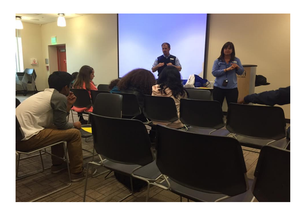
Community Credit Union explaining money saving tips to teens