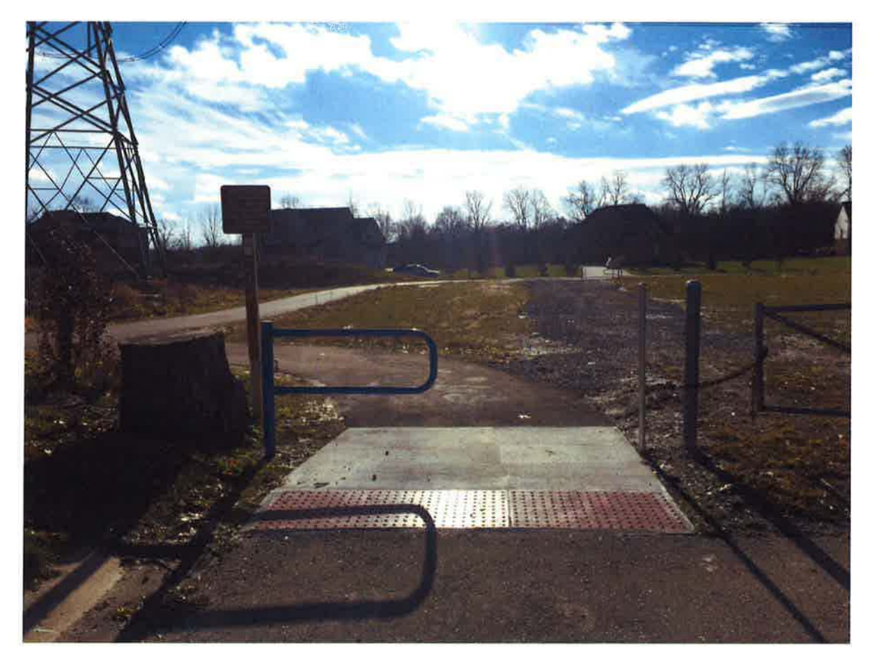
Pathway spurs to and from the new ITC Trail at Park Place and Deer Run.