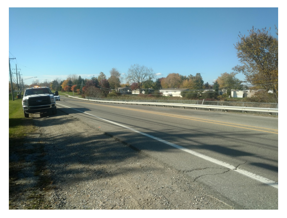
BEFORE – Looking west from Meadowbrook Road