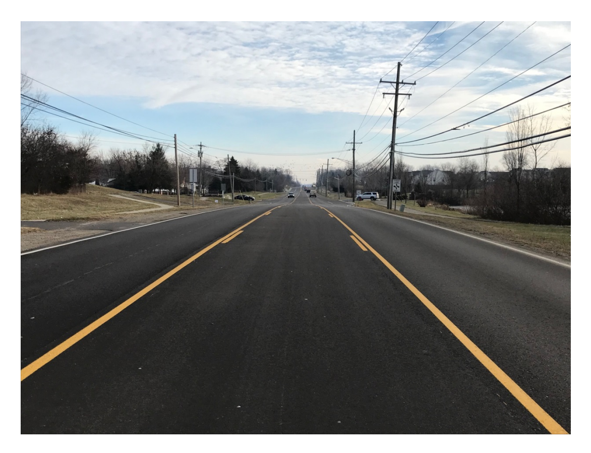
AFTER – Looking east towards Meadowbrook Road