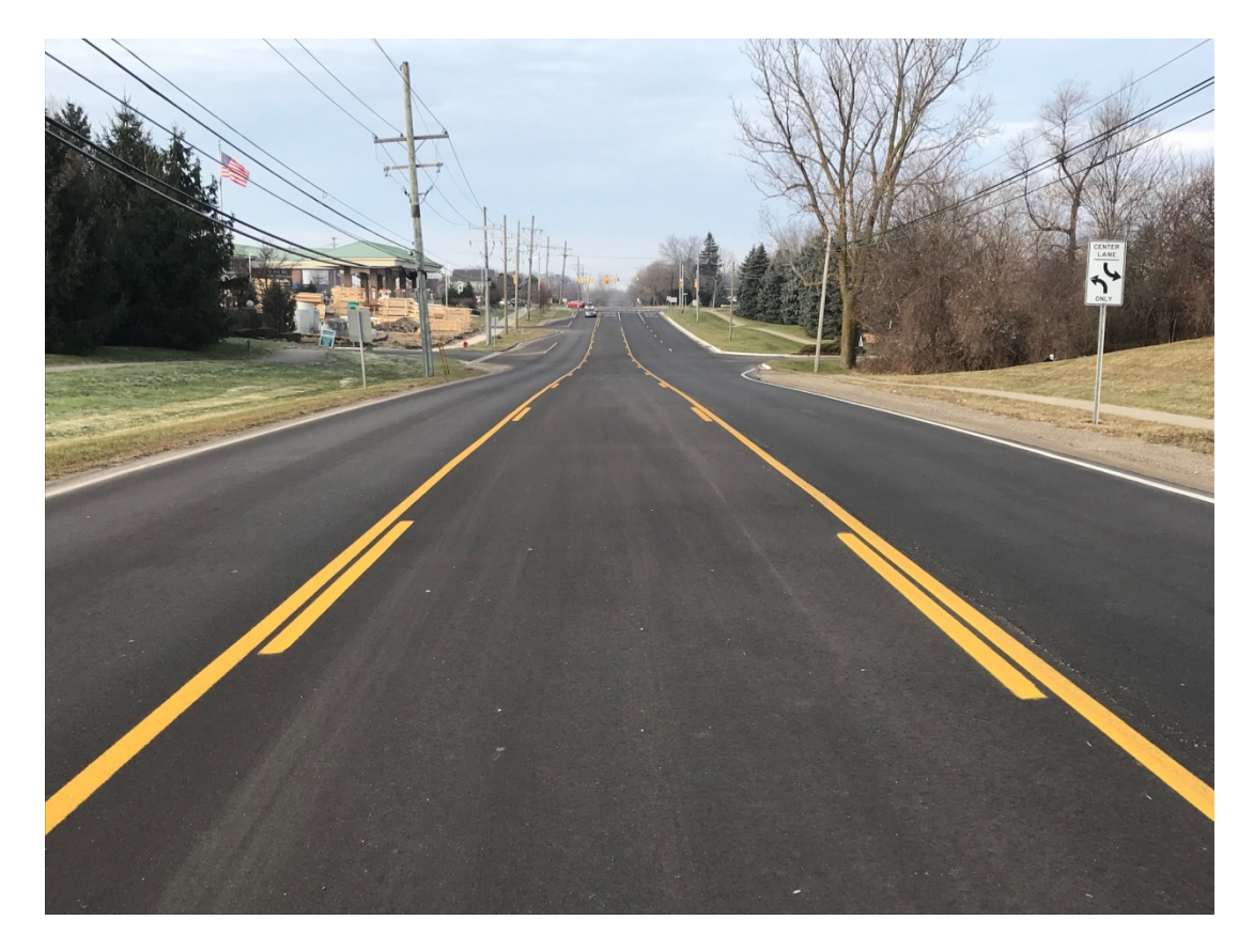
AFTER – Looking west towards Novi Road