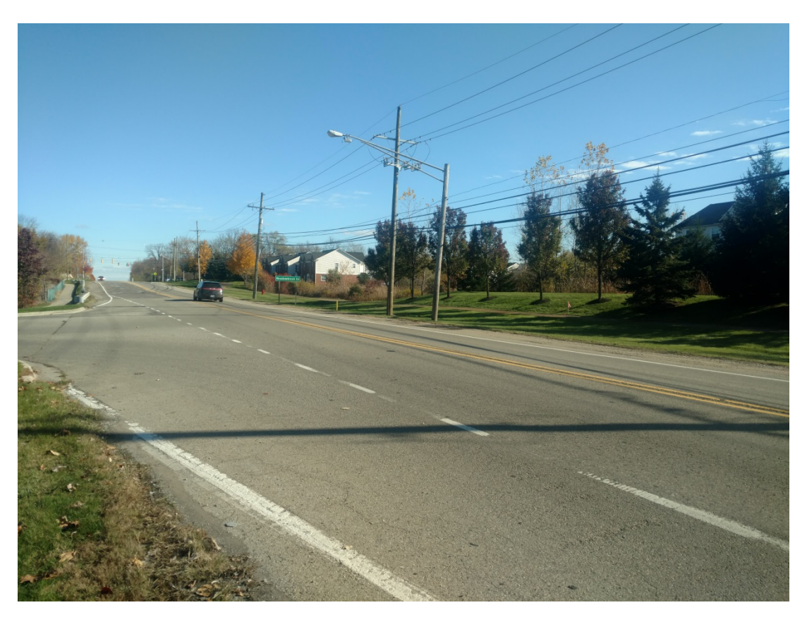
BEFORE – Looking east from LeGrande Boulevard