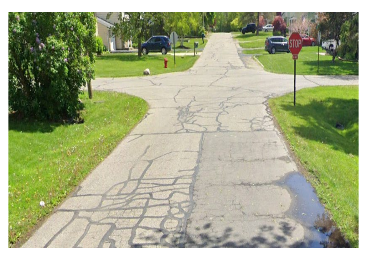
(Before) Wainwright Street – Looking east through Martin Avenue