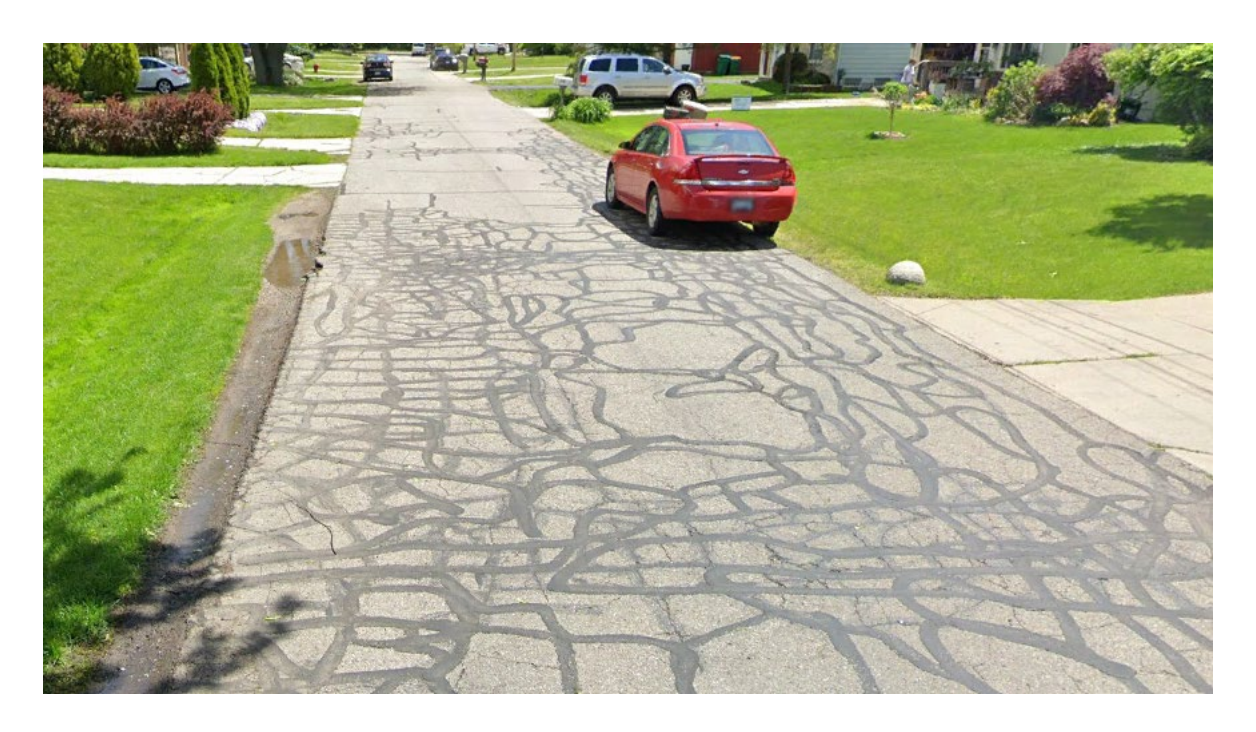
(Before) Linhart Street – Looking east towards Martin