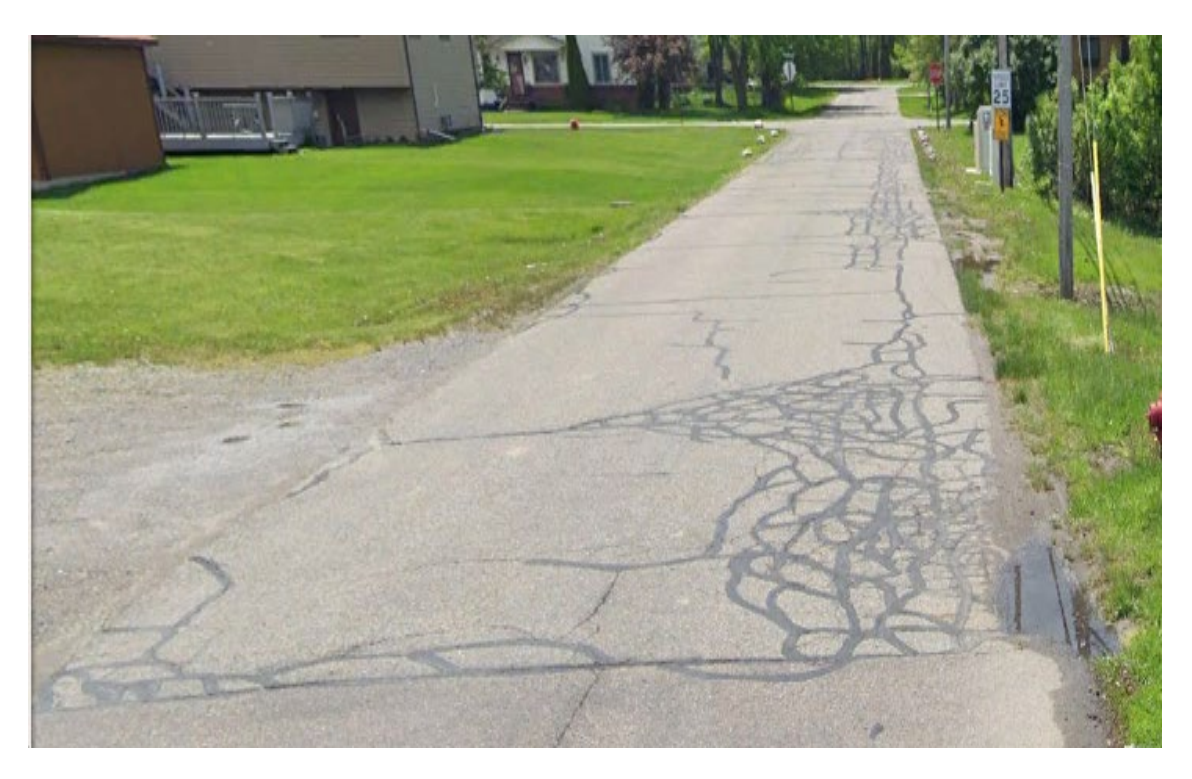
(Before) Martin Avenue – Looking south from 13 Mile