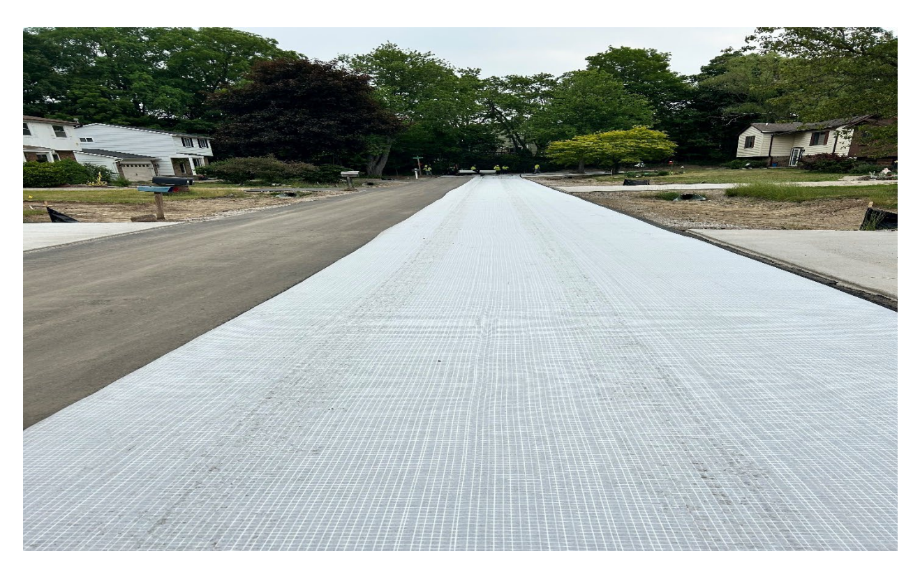
(After) Wainwright Street – Looking east from Martin Avenue – Placement of Interlayer Fabric