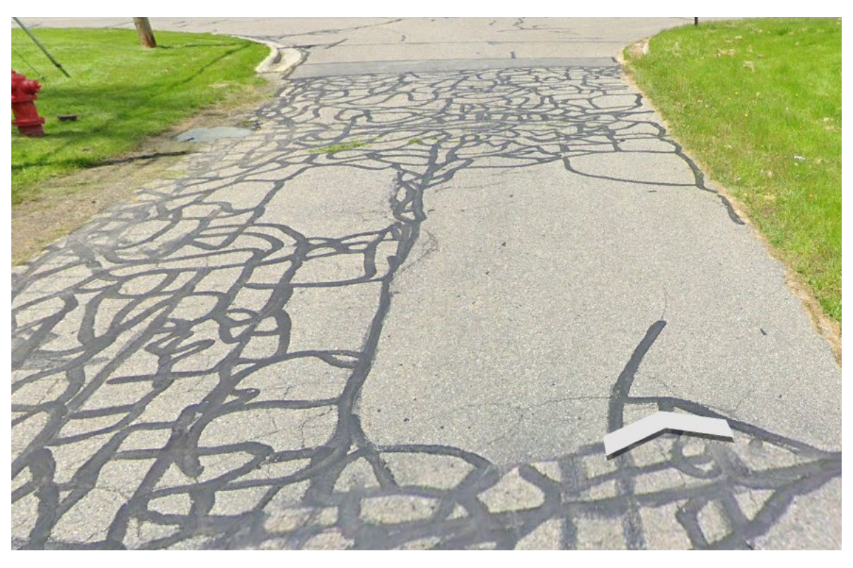
(Before) Linhart Street – Looking west towards Old Novi Road