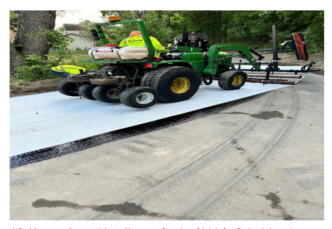
(After) Paramount Street at Linhart – Placement of Interlayer fabric before final asphalt wearing course