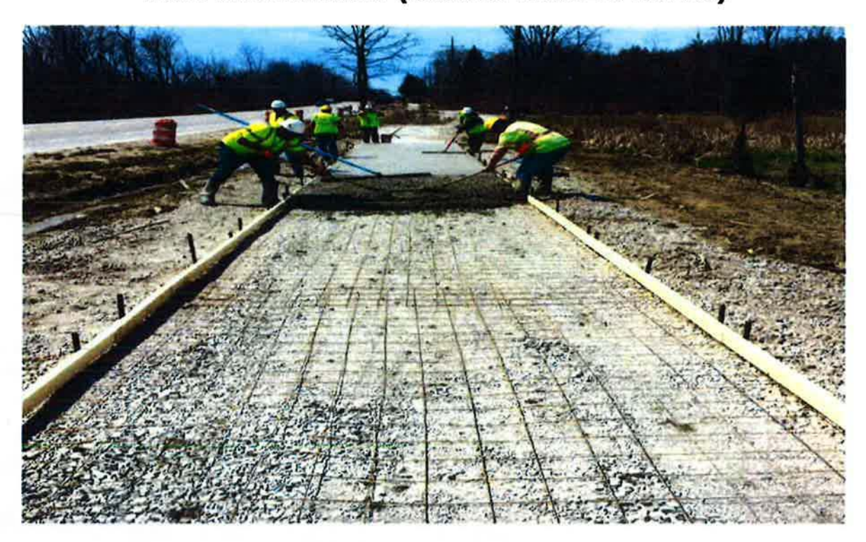
Looking west towards Garfield Road