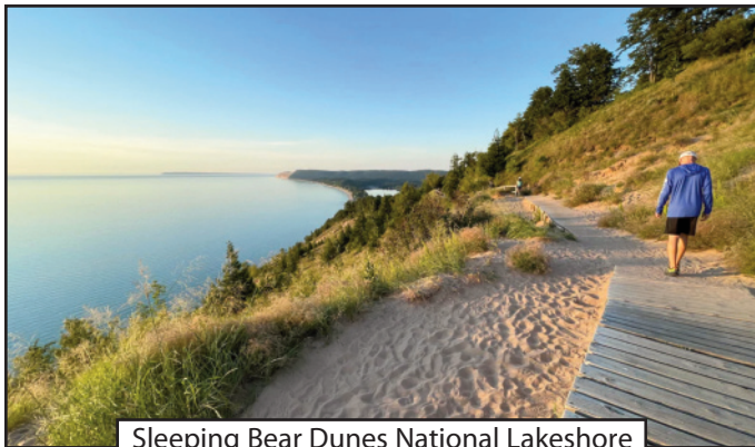
Sleeping Bear Dunes National Lakeshore

Novi Older Adult Services (248) 347-0414