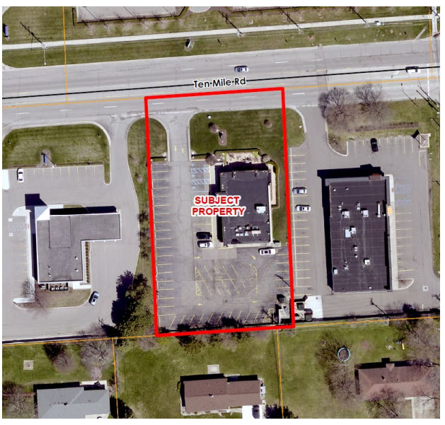
Current Image of Subject Property

Staff Comment: Moe's on Ten is an identifiable and popular local business in Novi. The signage and feel of the restaurant are unique to the City.