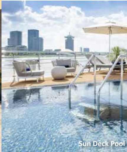
Sun Deck Pool