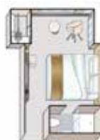
Suite Mozart Deck (284 sf)