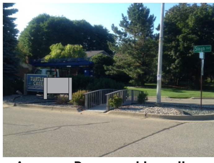
Approx. Proposed Location