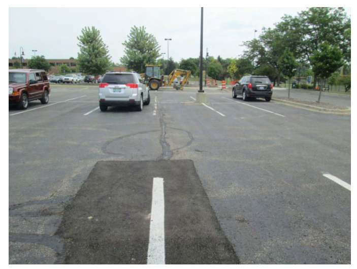
Civic Center Main Lot Area