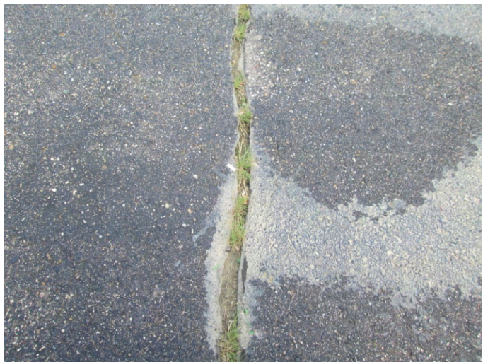
Civic Center Main Lot Area