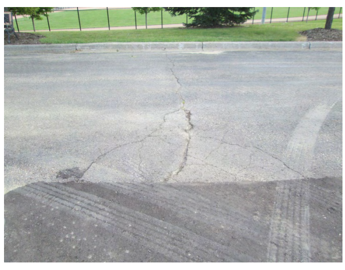
Civic Center Main Lot Area