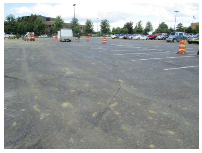
Civic Center Main Lot Area