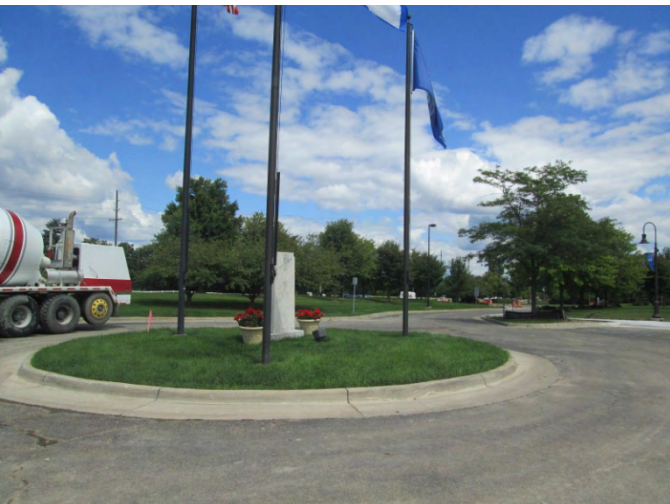
North Entrance Area