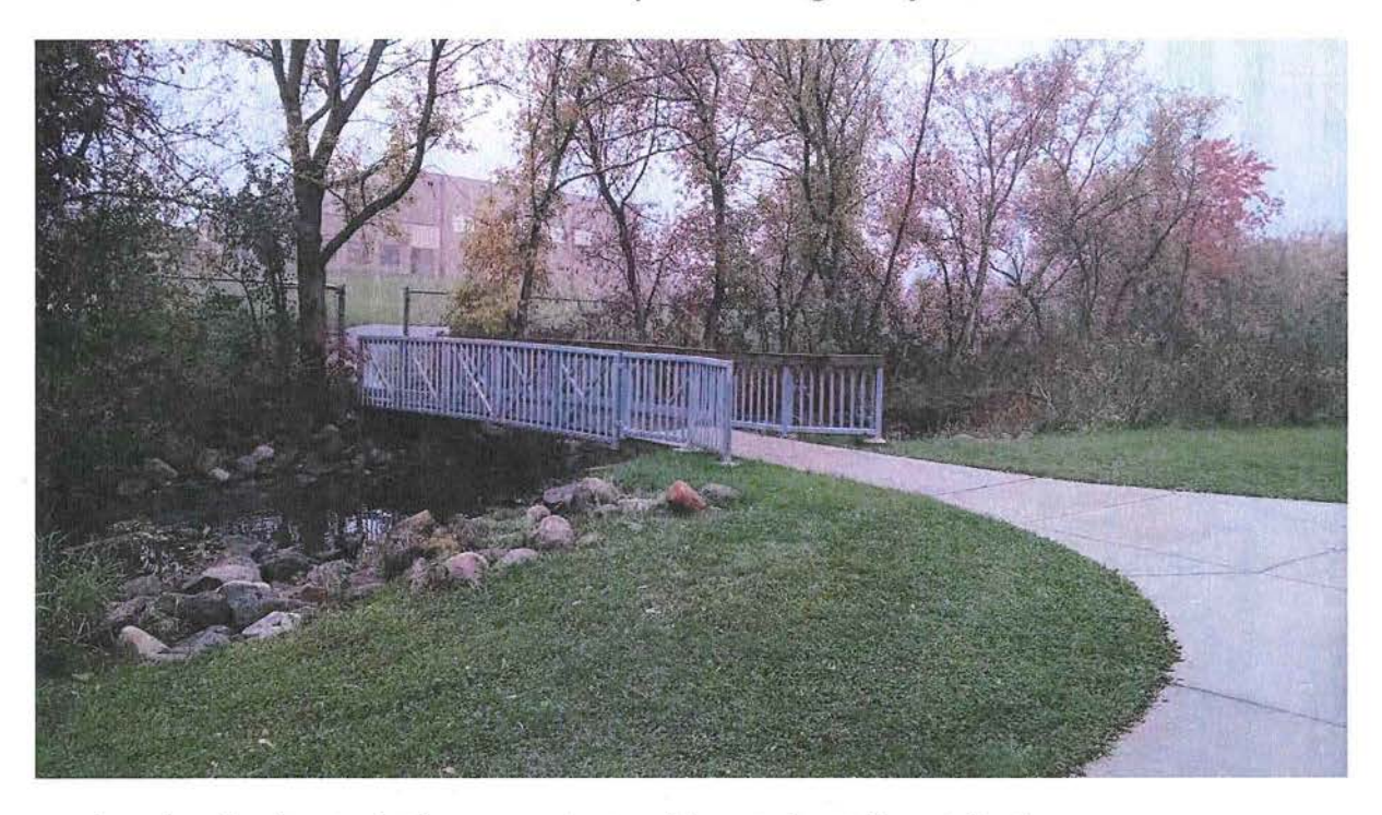
Newly replaced pedestrian bridge connecting Brookfarm Park to Village Oaks Elementary.