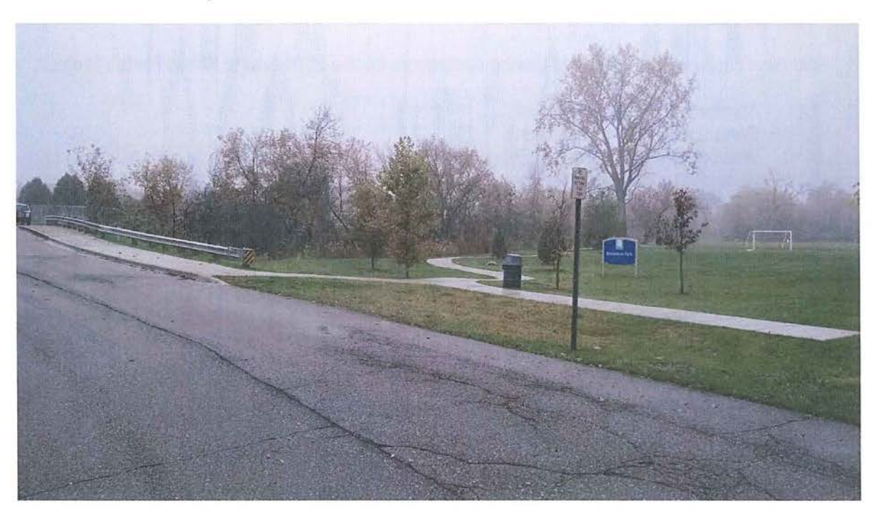
Another view of Willowbrook Drive.