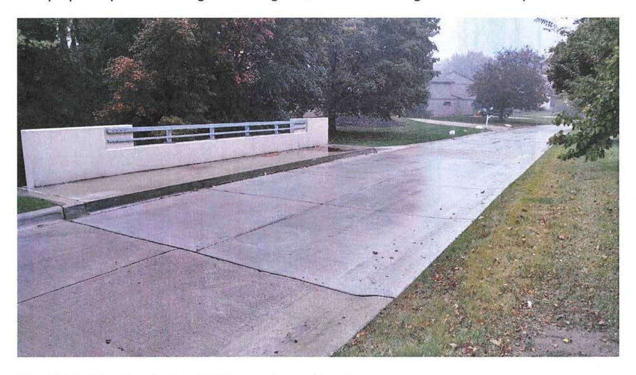
Rehabilitated Cranbrooke Drive Bridge over Ingersol Creek.