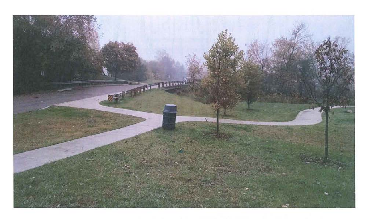
Willowbrook Drive Bridge Rehab and New Pathway along Willowbrook Drive and connection to Brookfarm Park Pathway