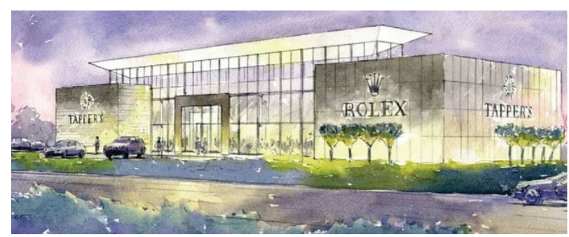
the east side of Haggerty Figure 4: TFJ of Novi

Consideration of the request of Broder and Sachse Real Estate for approval of the Preliminary Site Plan and Stormwater Management Plan. The subject property contains 1.16 acres and is located in Section 36, on the east side of Haggerty Road, north of Eight Mile