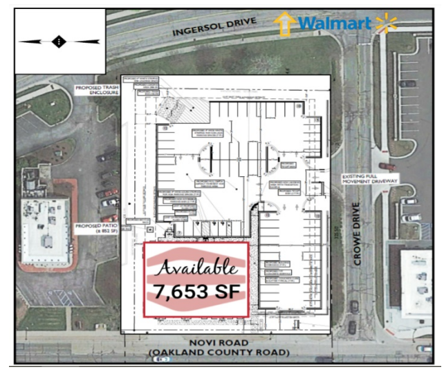
Figure 1: Storie Lou Plaza Plans

Consideration at the request of Alrig LLC for approval of a Preliminary Site Plan, Stormwater Management Plan, and Section 9 Façade Waiver. The subject property contains 1.41 acres and is located in Section 14, on the east side of Novi Road, north of Crowe Drive. The site is currently developed with a branch of the Fifth Third Bank. The applicant is proposing to redevelop the site into a 7,000 square foot multitenant building that proposes one retail tenant and one restaurant. Approval granted.