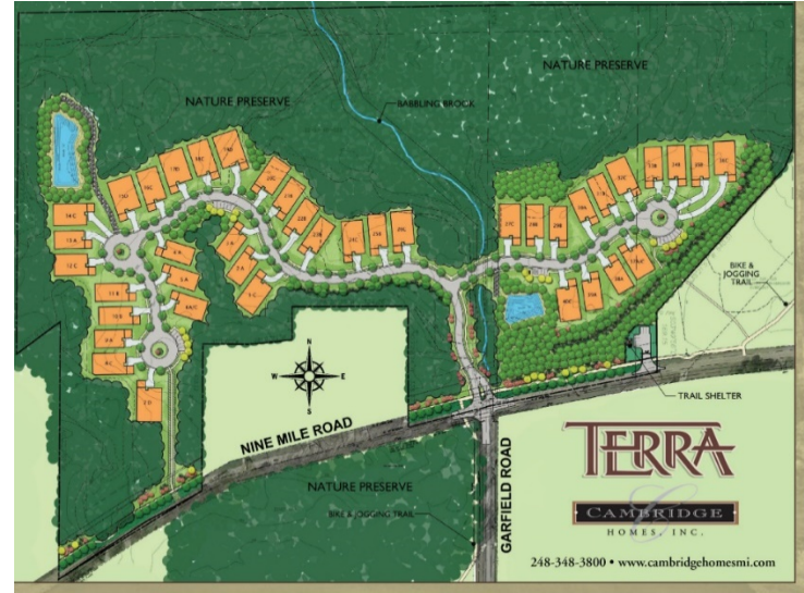
Figure 3: Terra Site Plan- cambridgehomesmi.com

Public hearing at the request of Cambridge Homes, Inc for Planning Commission approval of a Woodlands Permit for Phase 1A. The subject property is currently zoned R-1 (One-Family Residential) with a Planned Rezoning Overlay Agreement. The subject property is approximately 30-acres and is located east of Napier Road and on the north side of Nine Mile Road (Section 29, 30). The applicant previously received approval of a 41-unit single-family housing development. The previous Woodland Permit granted in 2018 has expired. Approval granted.