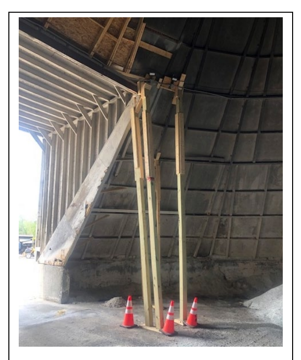
Damaged Framework and Entrance