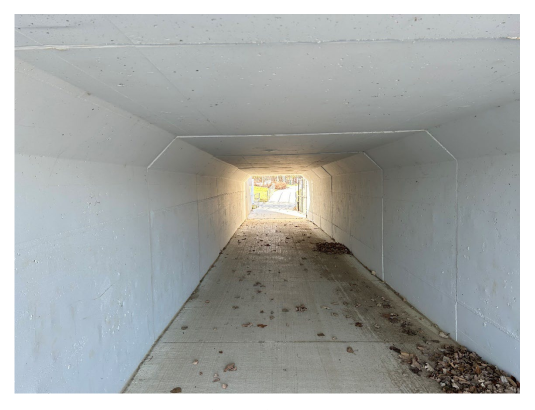
After – Inside tunnel