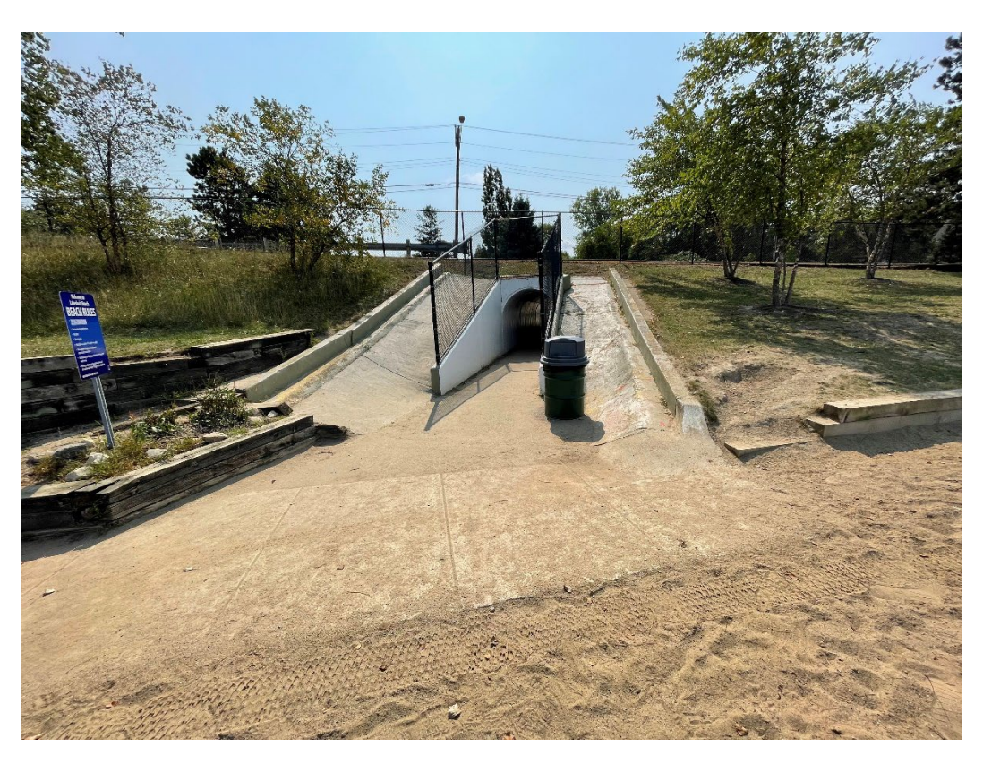
Before – Beach side (north)