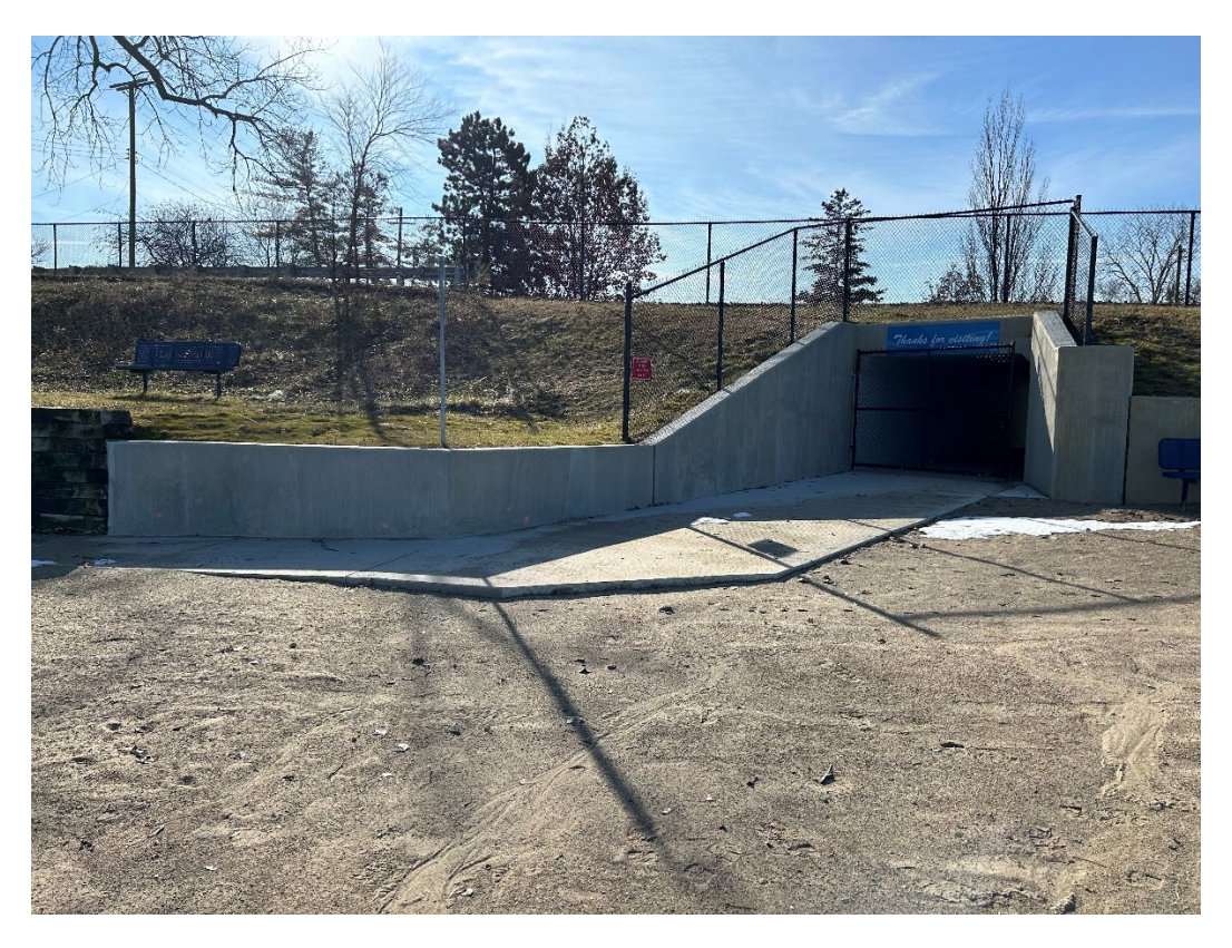
After – Beach side (north)