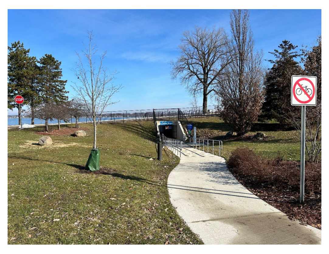
After – Park side (south)