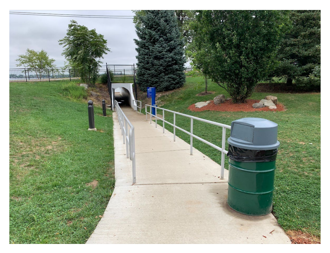
Before – Park side (south)