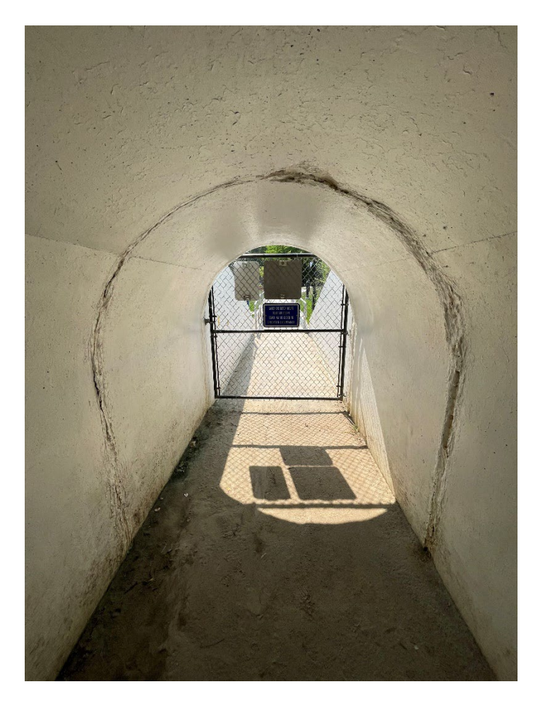
Before – Inside tunnel