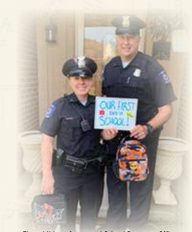
The addition of a second School Resource Officer promotes safety and continues to develop the long standing partnership between the Novi Police Department and Novi Community Schools.

In February 2019, the Insurance Services Office, ISO, rating for the City of Novi went from "5" to a "2" rating. This designation places the Novi Fire Department in the top two percent of the country and helps with insurance premiums.