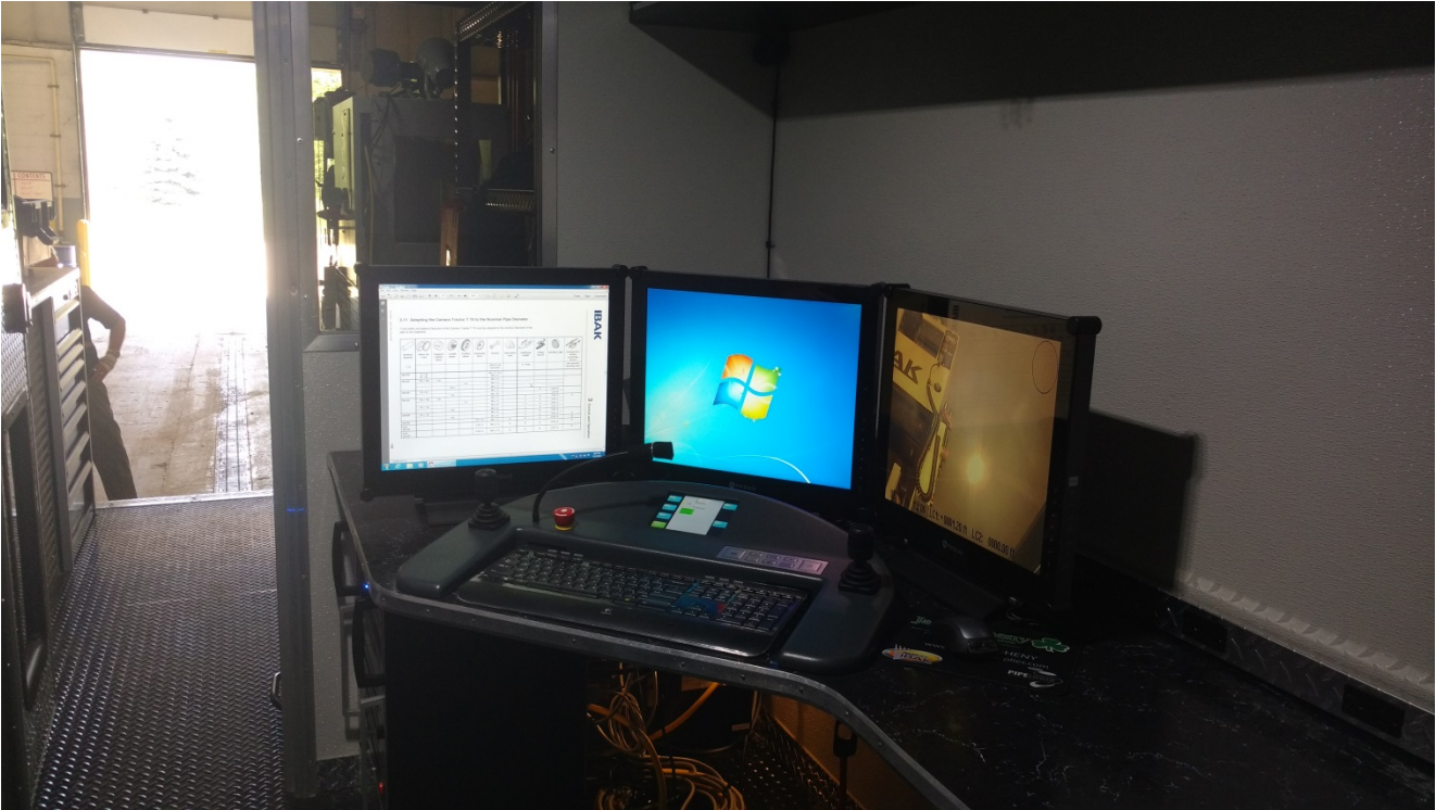
Command center controls inside van.