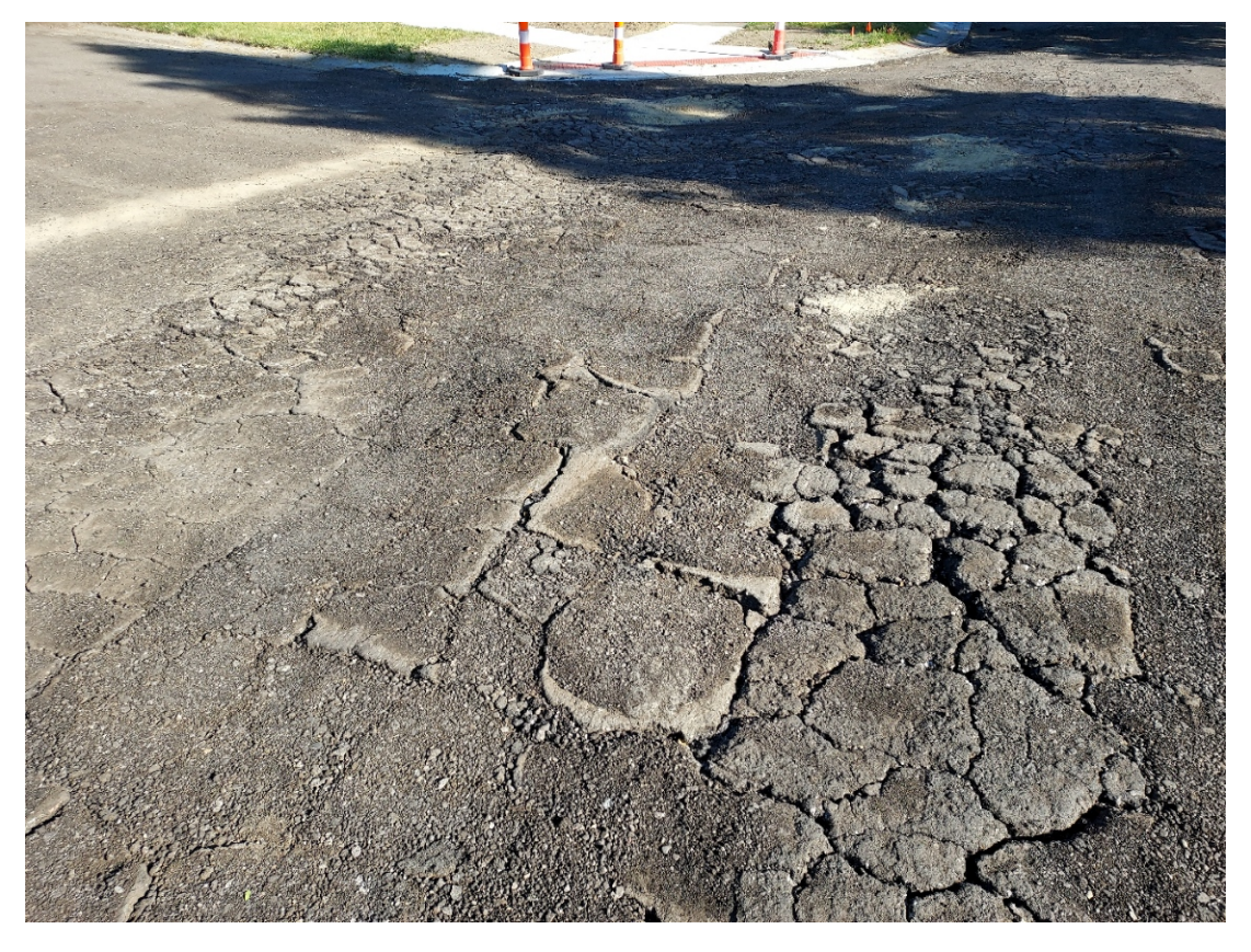
Southbound lane of Christina Lane, near Sussex Drive