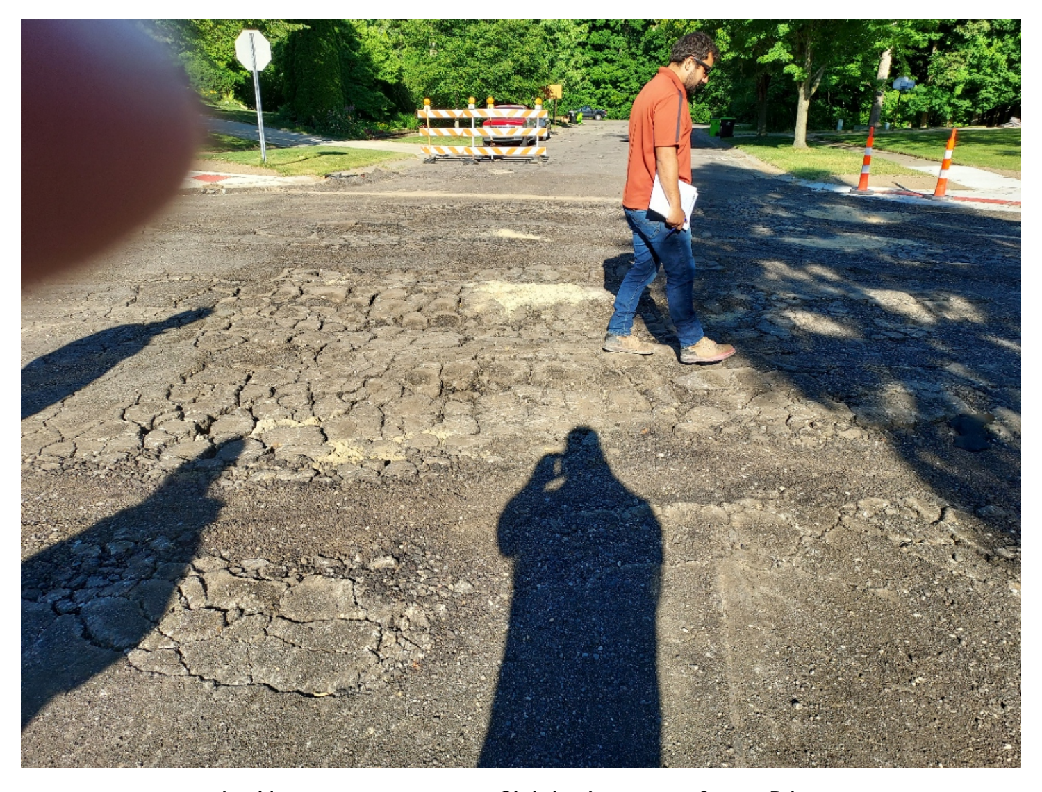
Looking east to west across Christina Lane, near Sussex Drive