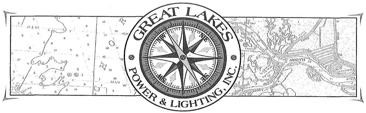
N 42 43' 39" W 82 41' 81"