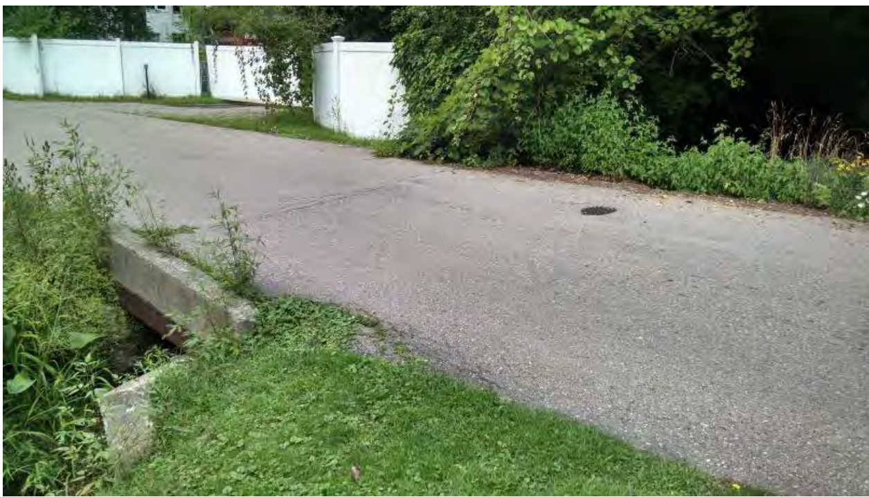
Sink Hole Recently Observed

Recently however, a sink hole was observed on top of the bridge (see black patched area in picture below). This is likely a sign that a portion of the bridge between the abutments is failing, and it will likely continue to get worse until it presents a dangerous condition. Therefore, it appears that the bridge should be replaced relatively soon. This course of action was confirmed by OHM, given the uncertainty of the structure below the surface. The replacement could be designed over the winter, with construction taking place in 2015. Until then, the bridge will be closely monitored by Field Operations staff to make sure it remains in stable and safe condition.