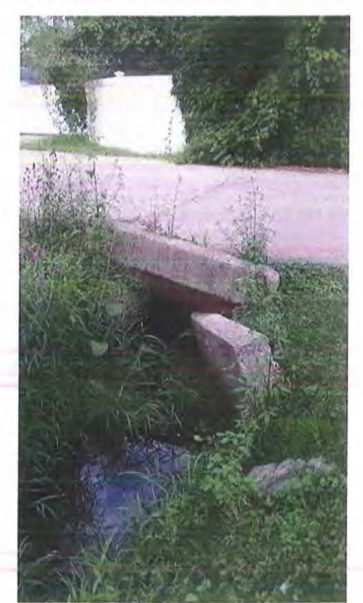
West End of Bridge

The small bridge on Whipple Street has been showing signs of deterioration over the last few years. Primarily, the abutments have shifted significantly, as can be seen in the pictures below. Field Operations staff has been monitoring the bridge since the shifted abutments were first noticed (possibly up to ten years ago). In August 2013, Engineering staff visited the site with a bridge engineer from Orchard, Hiltz, and McCliment (OHM). The bridge was identified as a Jack-Arch type bridge, and although the abutments have shifted, OHM did not see any immediate danger or signs of imminent failure. Therefore, it was determined that closure of the bridge isn't required, but rather observation of the bridge should continue with frequent visual inspections.