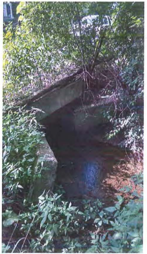
East End of Bridge