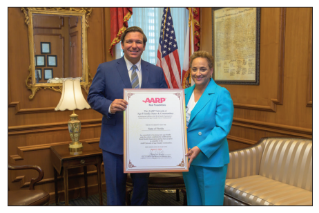
State of Florida