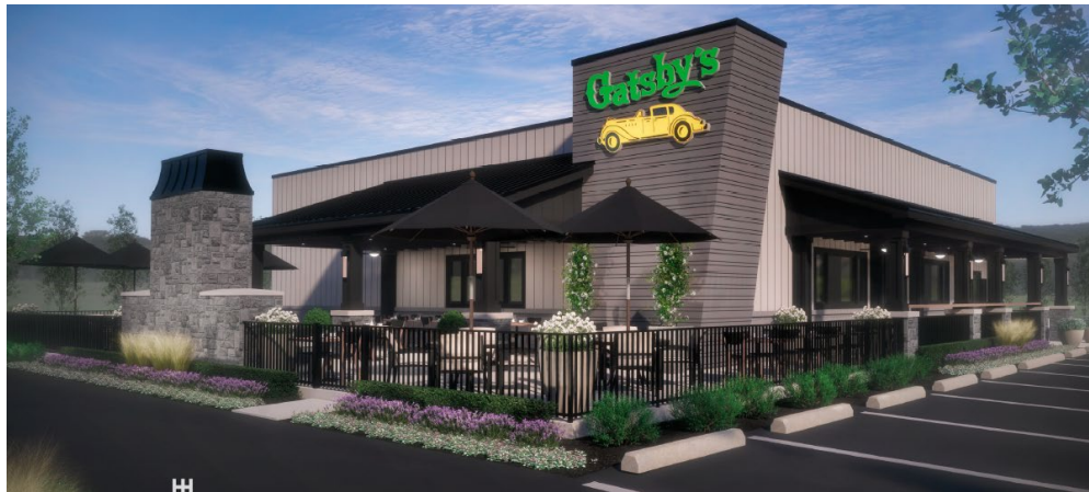
Figure 4: Gatsby's Rendering, as provided by the applicant

Public hearing at the request of Tower Built LLC for Special Land Use and Preliminary Site Plan approval for the exterior renovation of the existing Gatsby's Restaurant. The subject property is approximately 1.09 acres and is located at 45701 Grand River Avenue.