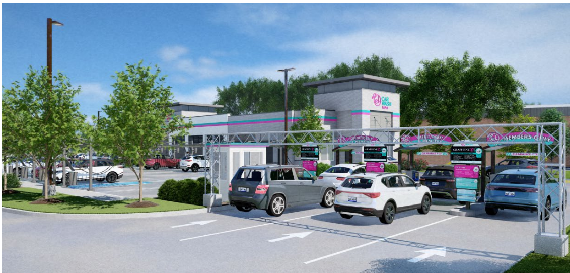
Figure 1: El Car Wash Rendering, as provided by the applicant

Consideration of El Car Wash for Preliminary Site Plan and Stormwater Management Plan approval. The subject property is 1.22 acres in size and is located on the north side of Grand River Avenue, east of Wixom Road. The subject property is zoned B-3 General Business. The applicant is proposing to demolish the former PNC bank building and construct a 3,700 square foot, drive-thru car wash.