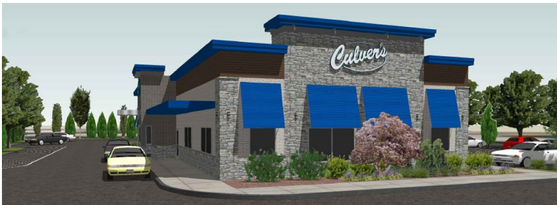
Figure 3: Culver's Rendering, as provided by the applicant

Public Hearing at the request of Union Pacific Holdings for recommendation to the City Council for Preliminary Site Plan with a PD-2 Option, Special Land Use, and Stormwater Management Plan approval. The subject property is located at the northwest corner of Novi Road and West Oaks Drive in Section 15 and totals approximately 1.69 acres. The applicant is proposing to develop a 4,160 square foot Culver's restaurant with a drive-thru. The applicant is proposing to vacate and move a portion of Karevich Drive so that it traverses through the site.