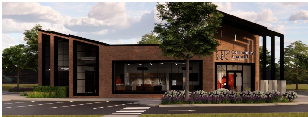
Figure 5: Community Financial Rendering, as provided by applicant

Public Hearing at the request of Level 5 Construction LLC for Preliminary Site Plan, Woodland Permit, and Stormwater Management Plan approval to build a Community Financial Credit Union. The subject parcel is zoned TC, Town Center District and is located at the northeast corner of Crescent Boulevard and Grand River Avenue. The applicant is proposing a 3,000 square foot building on 1.57 acres of land.