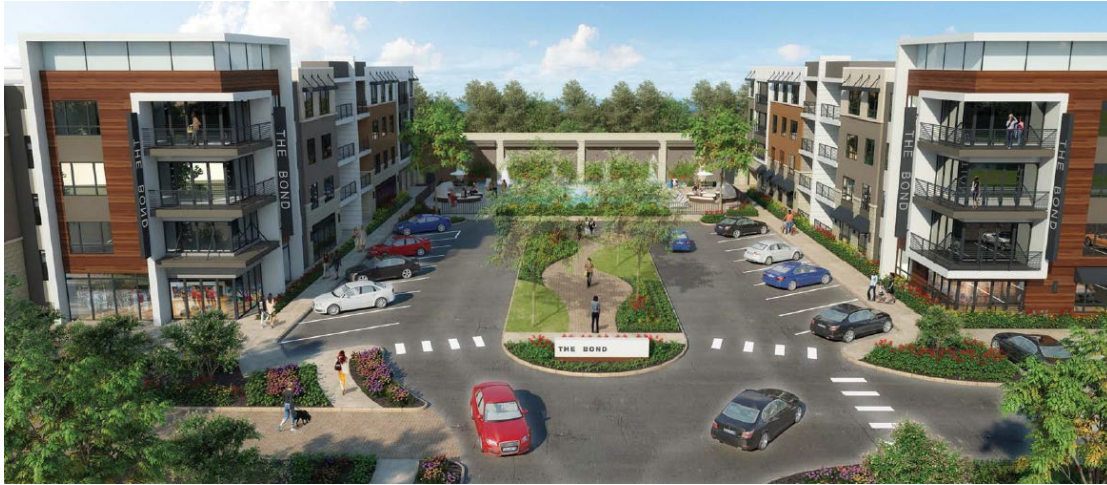
Figure 2: The Bond Rendering, as provided by the applicant

Public Hearing at the request of Bond at Novi LLC for JSP18-10 for recommendation to the City Council for approval or denial of the revised Preliminary Site Plan, Woodland Permit and Stormwater Management Plan. The revised plans propose to add a fifth floor to accommodate additional units.