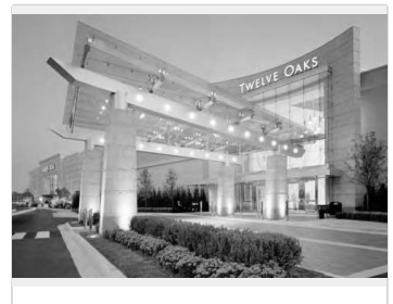
Large regional mall