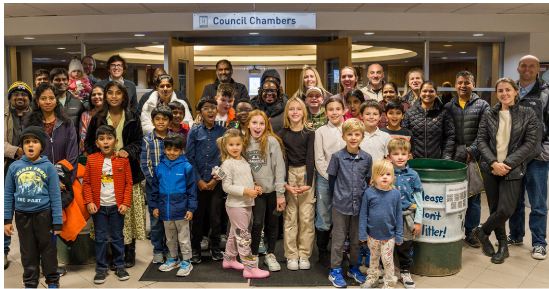
Village Oaks students and staff at the November Parks, Recreation and Cultural Services Commission meeting.