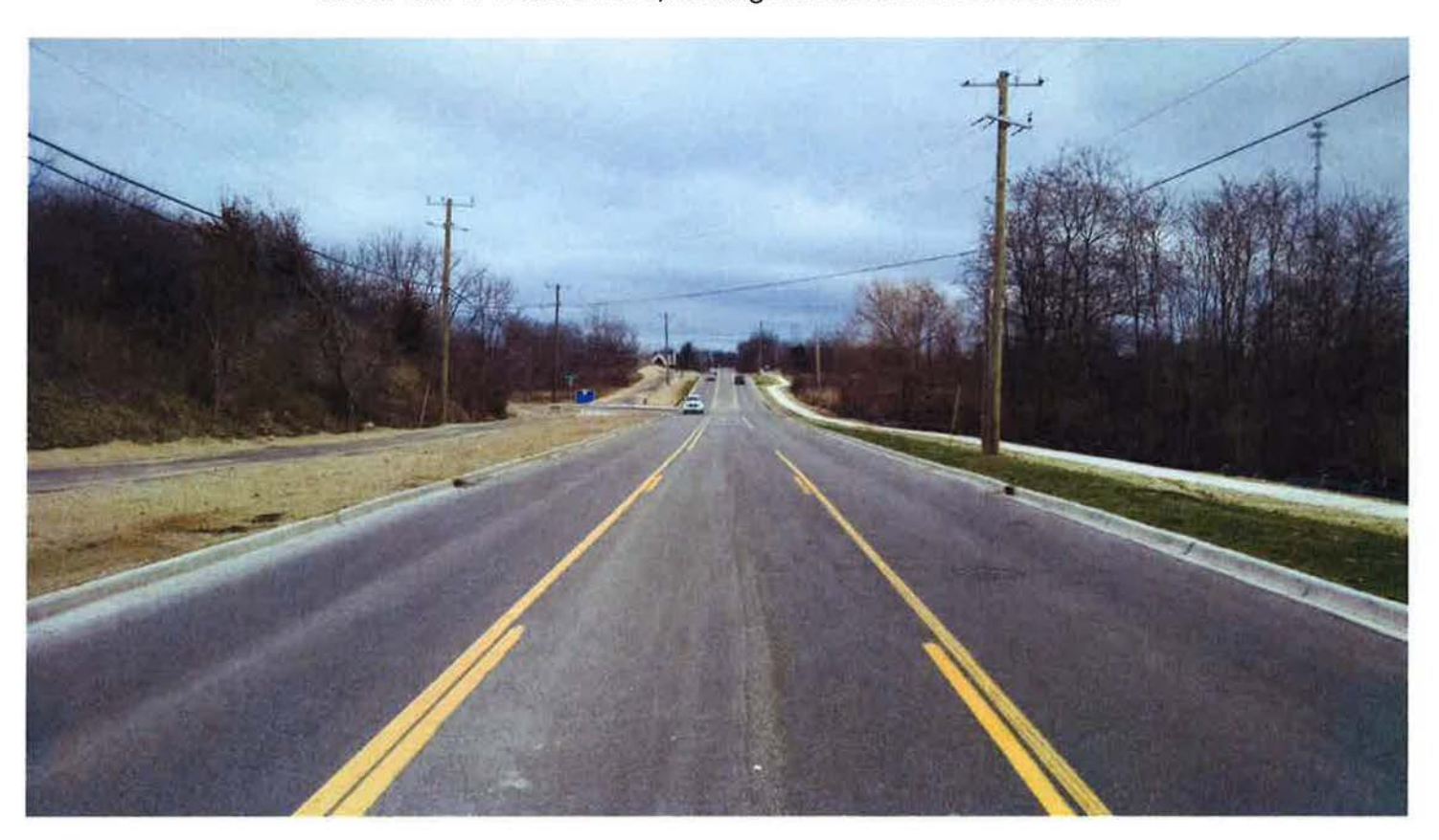
Center of 11 Mile Road, looking east from Town Center Drive.