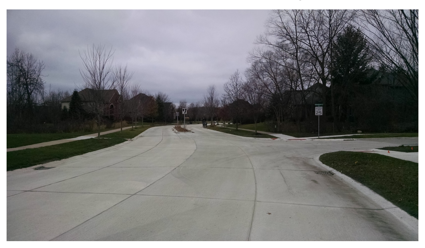
White Pines Drive at Burlington Court – Looking West