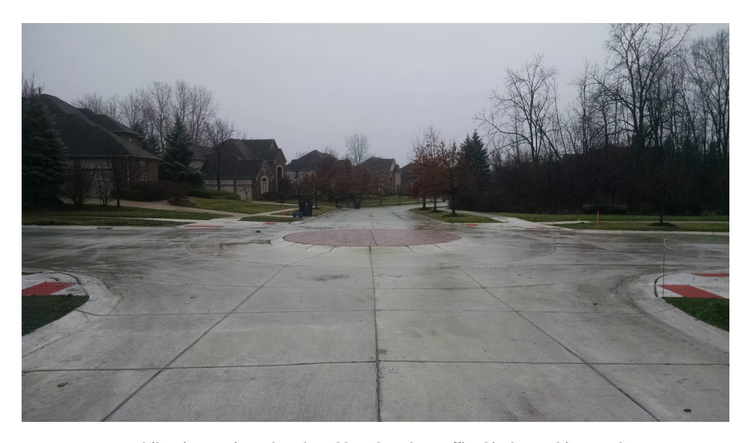
White Pines Drive at Arden Glen Court – Traffic Circle Looking East