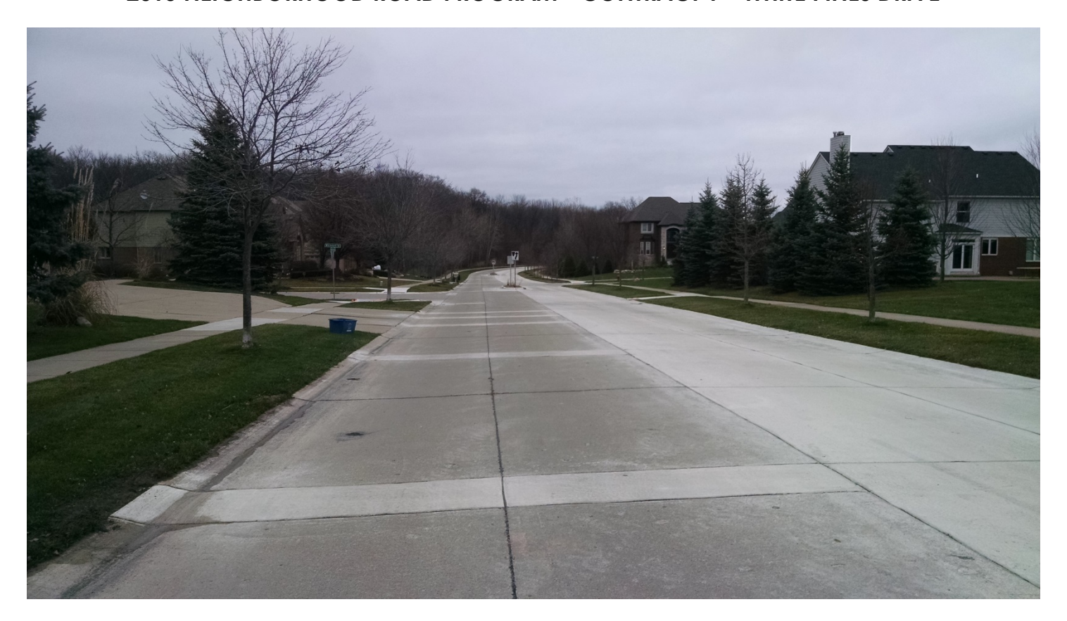
White Pines Drive at White Hall Drive – Looking East