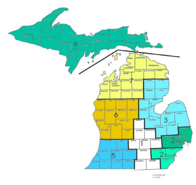
Figure 1 Michigan MABAS Regions

With the assistance of the Plan Coordinators, the individual member fire departments will be given the opportunity to designate resources available in support of the Plan. The combined resources of the seven regions comprise the Plan's resource network.