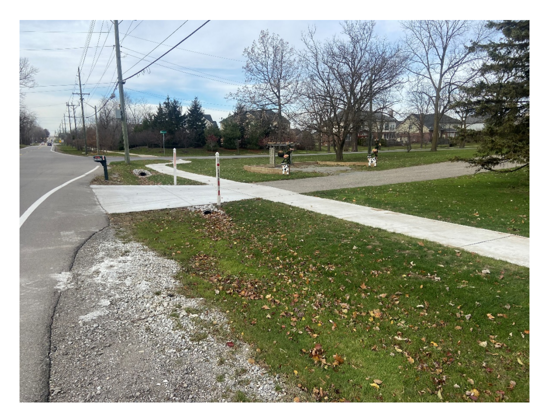
After - East of Dinser Drive, looking west