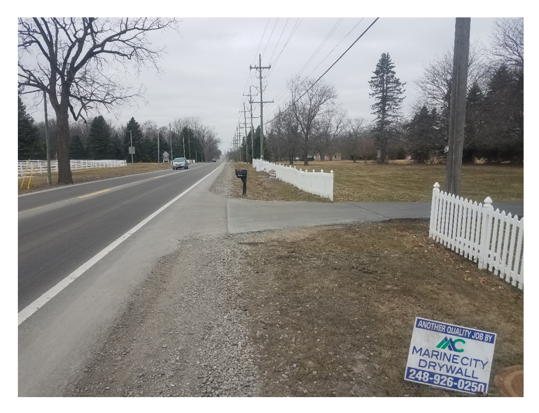
Before - West of the ITC Corridor, looking west