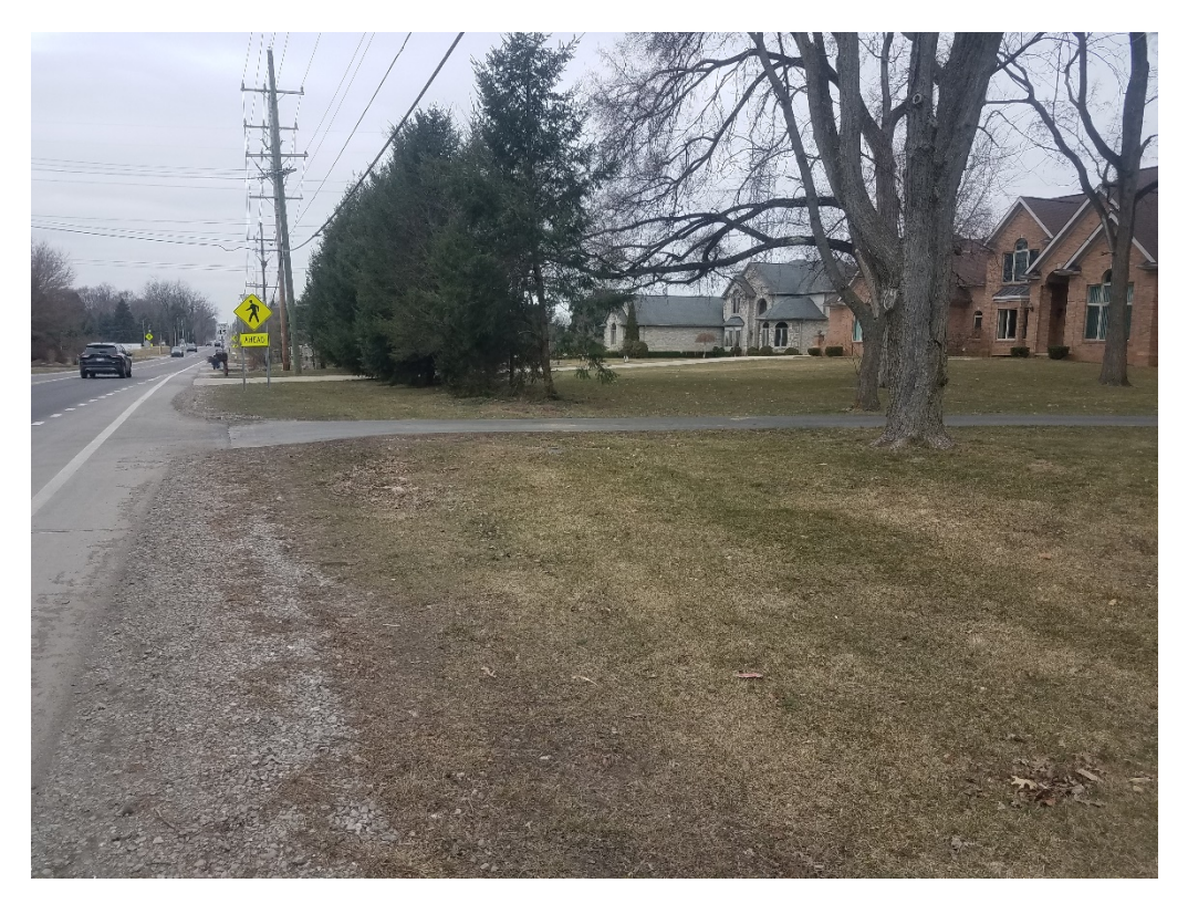
Before - West side of Woodham Road, looking west