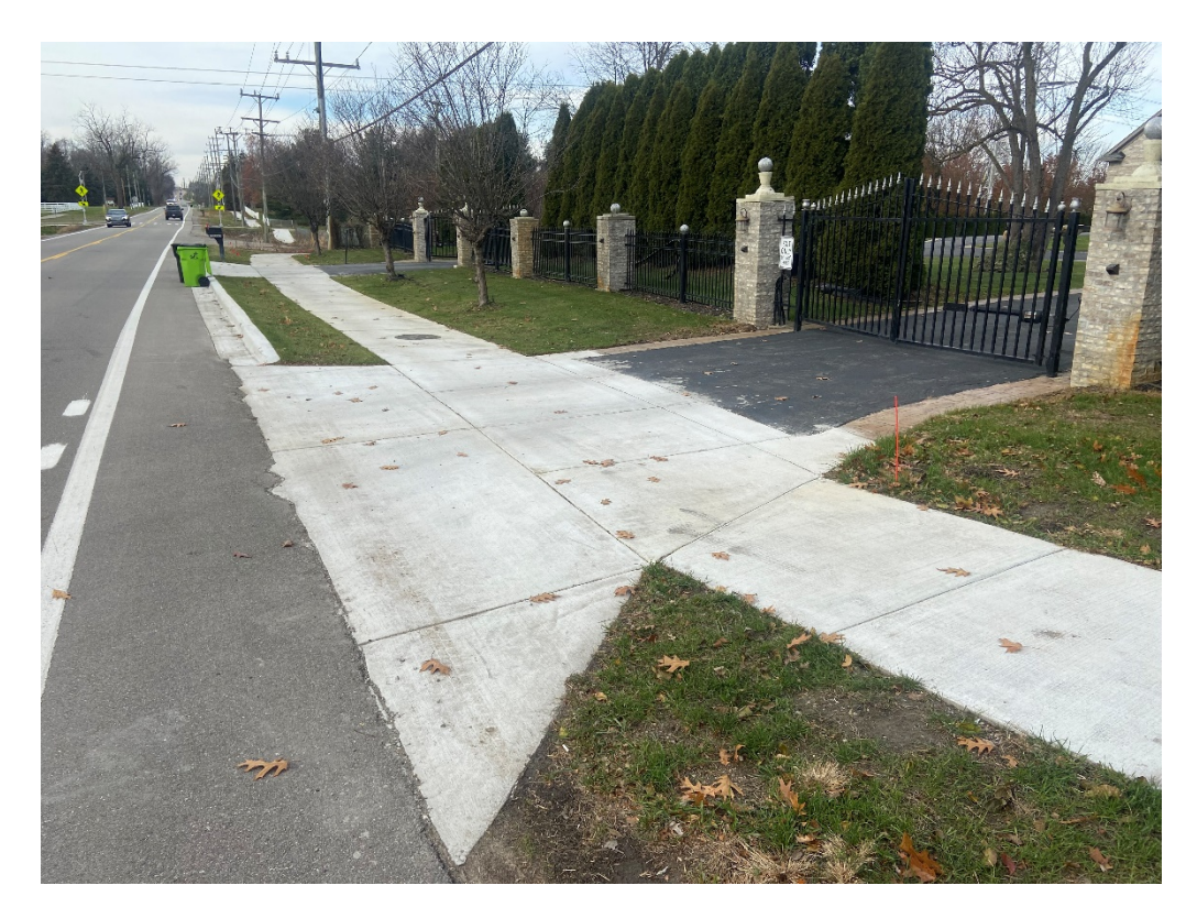
After - East of the ITC Corridor, looking west