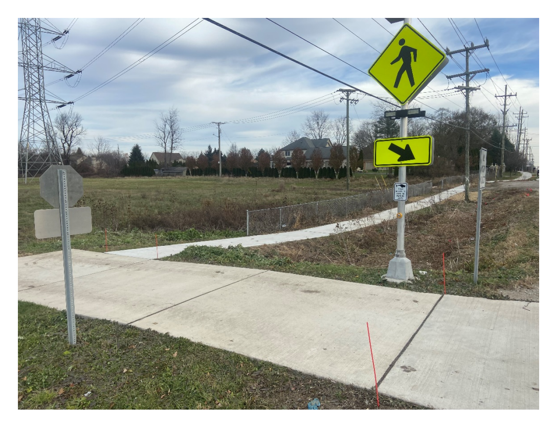
After - At the ITC Corridor, looking east