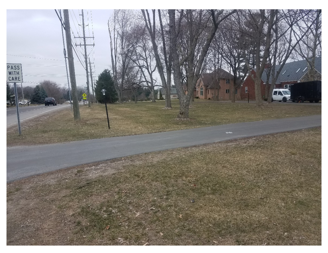
Before - East side of Woodham Road, looking west