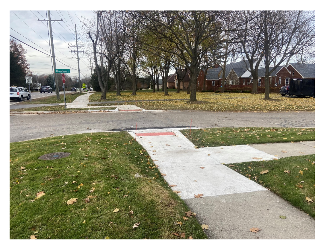
After - East side of Woodham Road, looking west