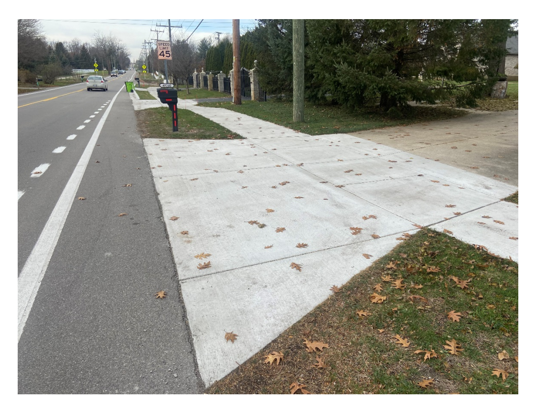
After - West side of Woodham Road, looking west