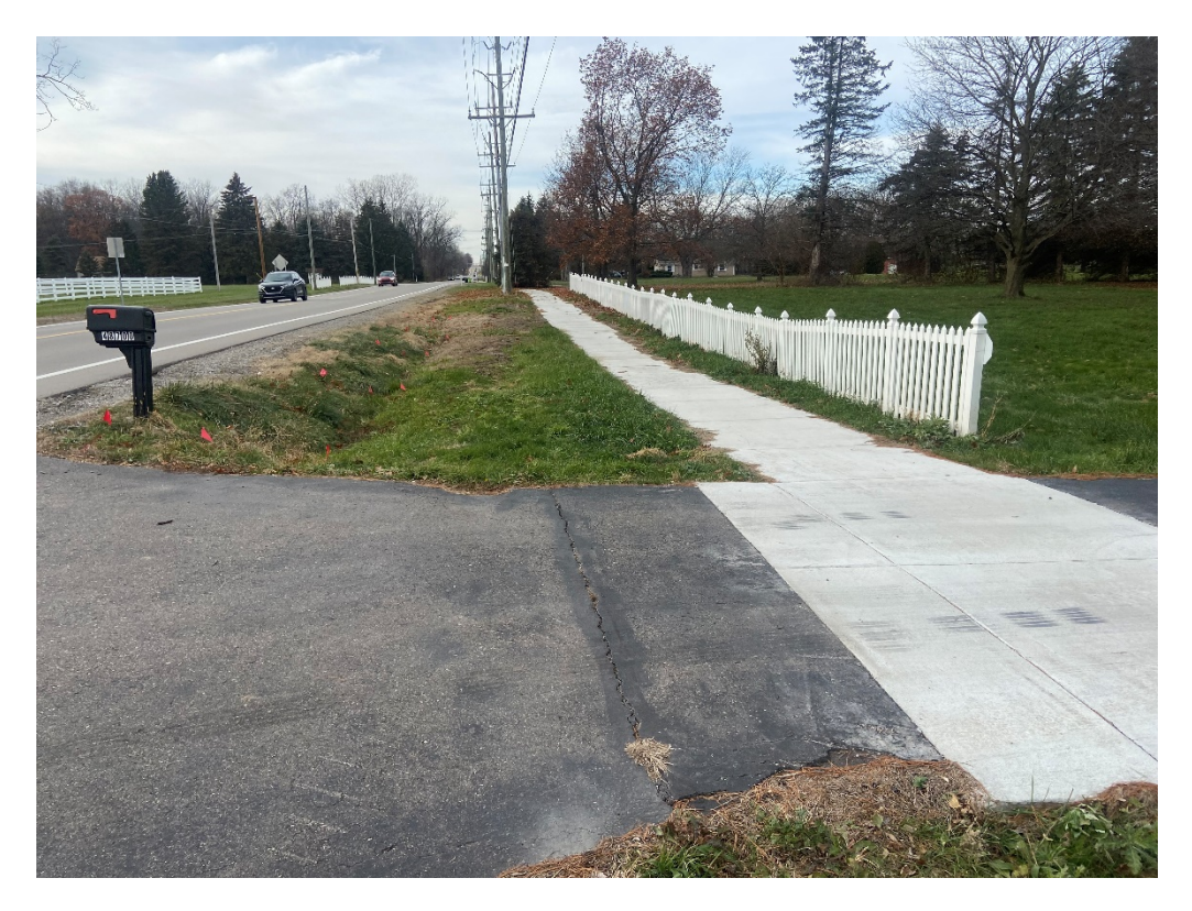
After - West of the ITC Corridor, looking west