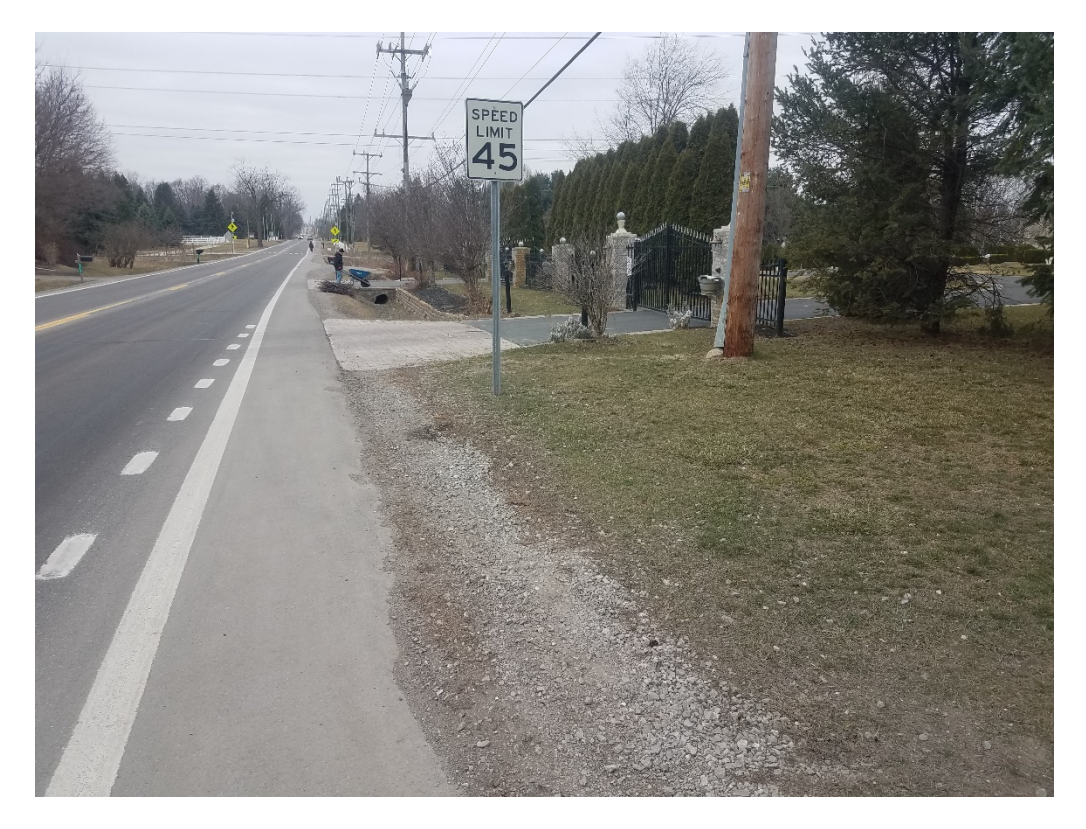
Before - East of the ITC Corridor, looking west