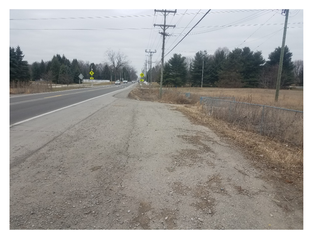
Before – At the ITC Corridor, looking west