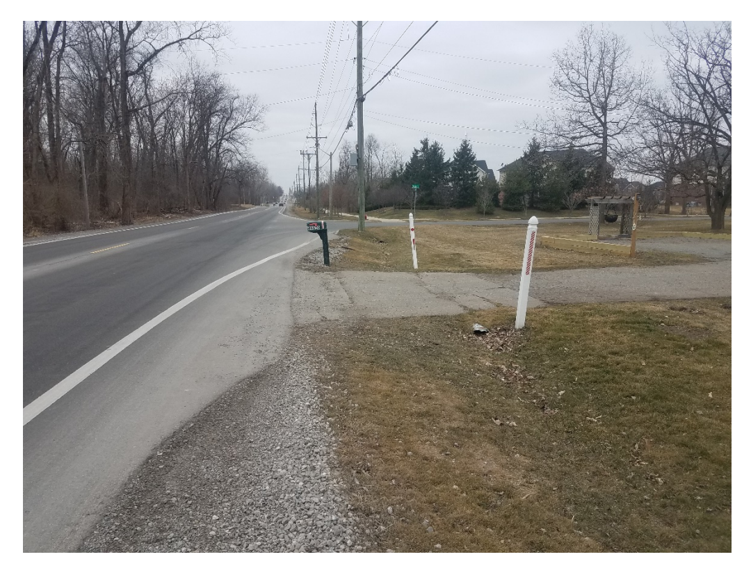
Before - East of Dinser Drive, looking west