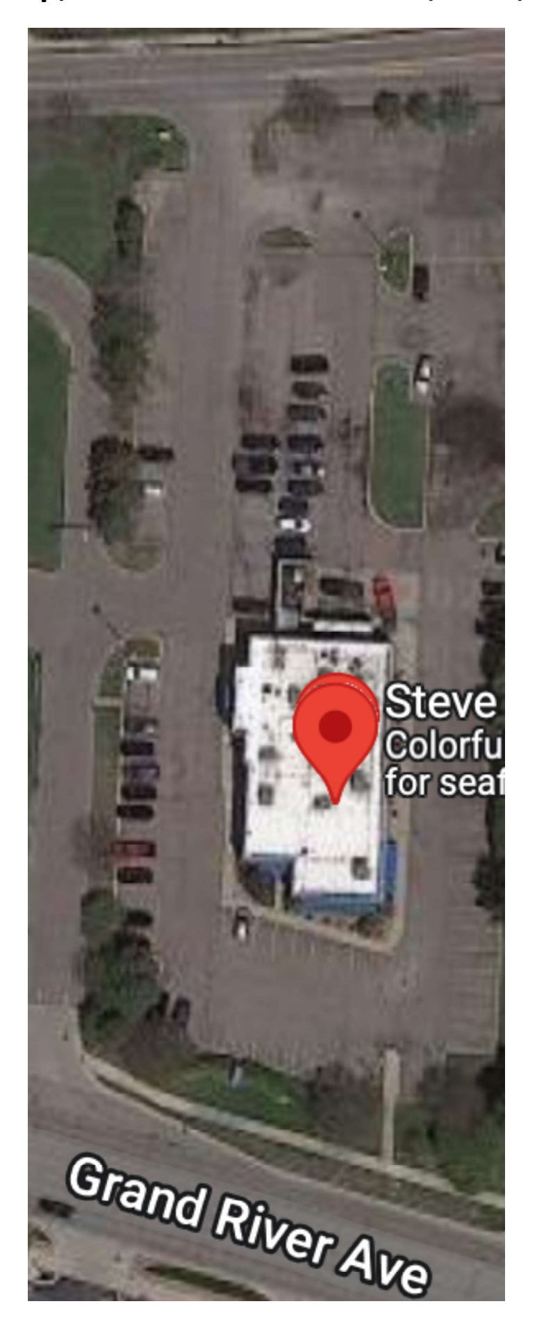
S&R Site Map, 43150 Grand River Ave, Novi, MI 48375