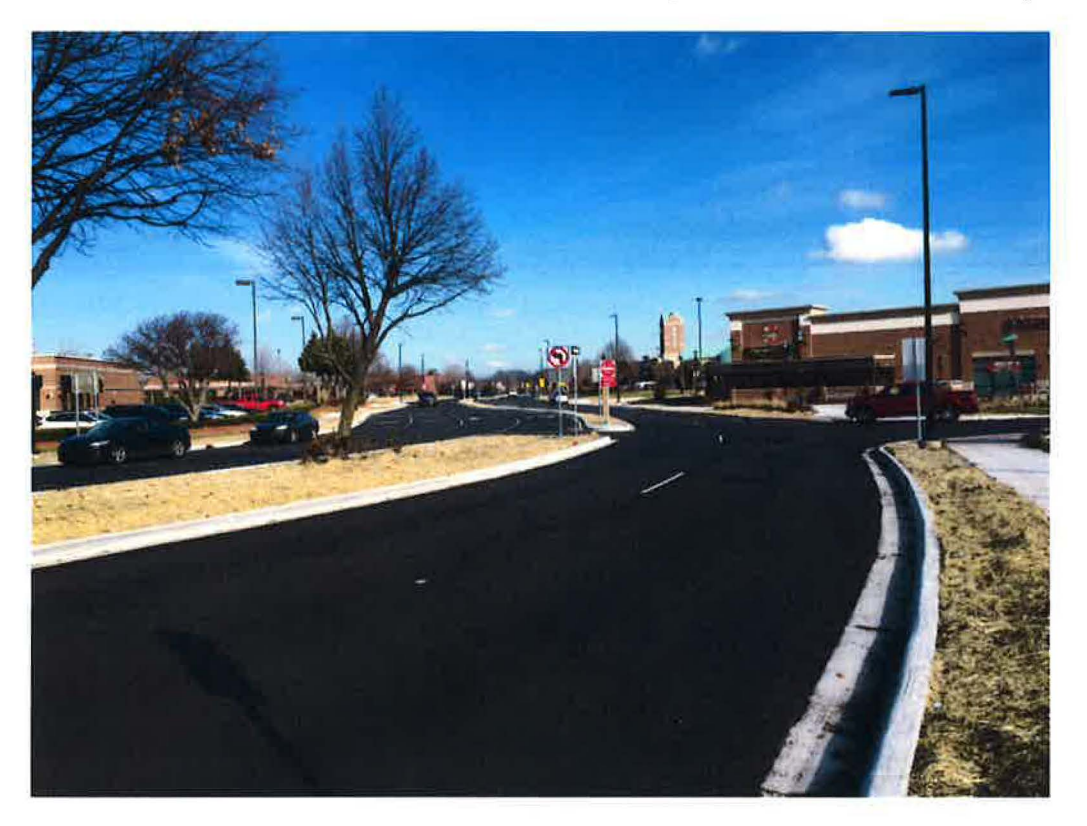
Looking east from Novi Road towards Ingersol Drive