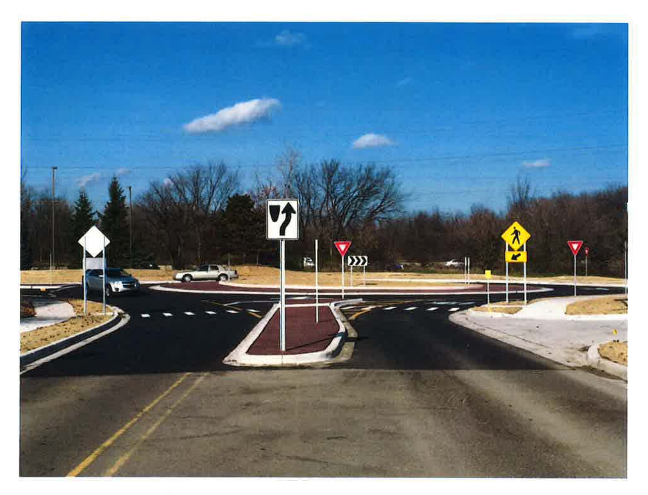
Town Center Drive - Looking north towards roundabout at Crescent Boulevard