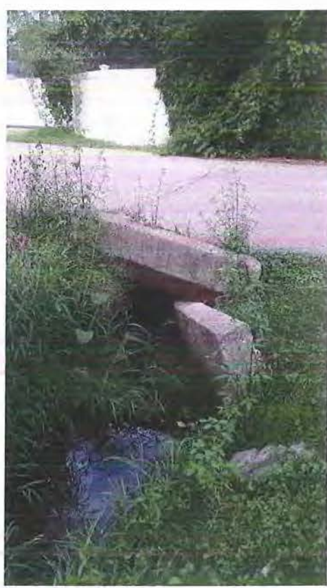
West End of Bridge

The small bridge on Whipple Street has been showing signs of deterioration over the last few years. Primarily, the abutments have shifted significantly, as can be seen in the pictures below. Field Operations staff has been monitoring the bridge since the shifted abutments were first noticed (possibly up to ten years ago). In August 2013, Engineering staff visited the site with a bridge engineer from Orchard, Hiltz, and McCliment (OHM). The bridge was identified as a Jack-Arch type bridge, and although the abutments have shifted, OHM did not see any immediate danger or signs of imminent failure. Therefore, it was determined that closure of the bridge isn't required, but rather observation of the bridge should continue with frequent visual inspections.