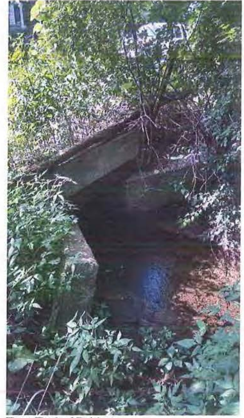
East End of Bridge