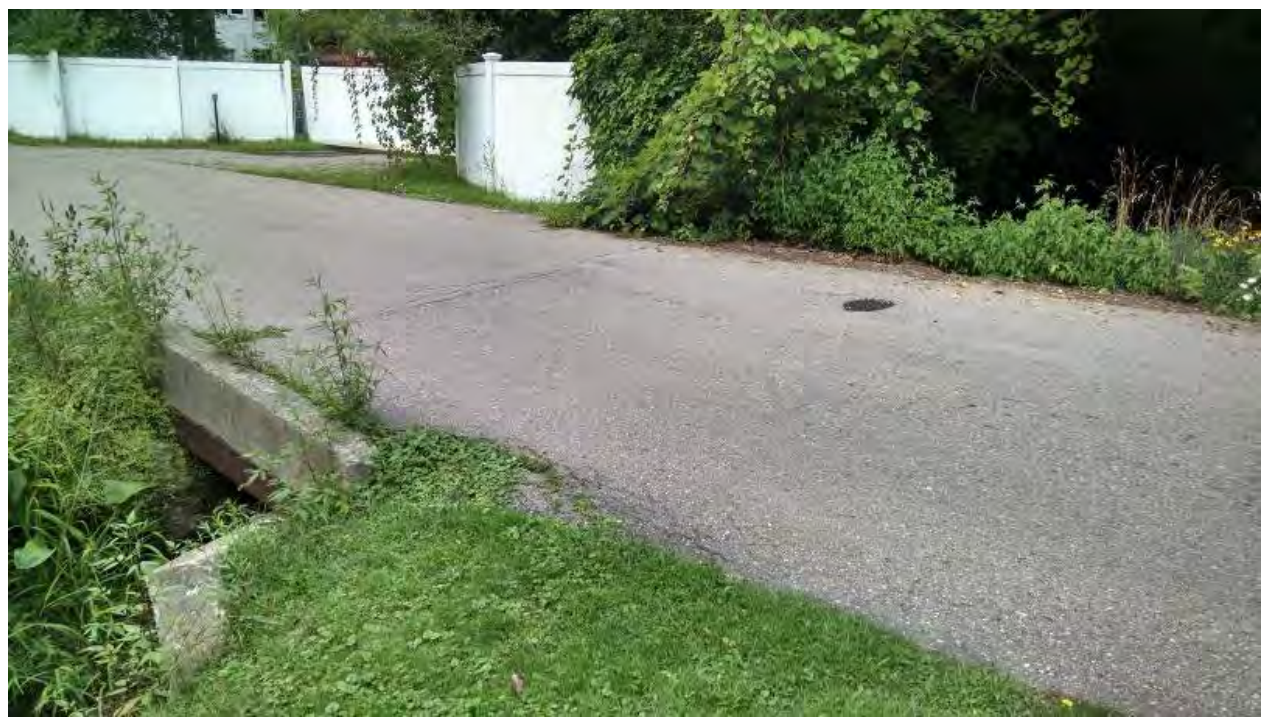
Sink Hole Recently Observed

Recently however, a sink hole was observed on top of the bridge (see black patched area in picture below). This is likely a sign that a portion of the bridge between the abutments is failing, and it will likely continue to get worse until it presents a dangerous condition. Therefore, it appears that the bridge should be replaced relatively soon. This course of action was confirmed by OHM, given the uncertainty of the structure below the surface. The replacement could be designed over the winter, with construction taking place in 2015. Until then, the bridge will be closely monitored by Field Operations staff to make sure it remains in stable and safe condition.