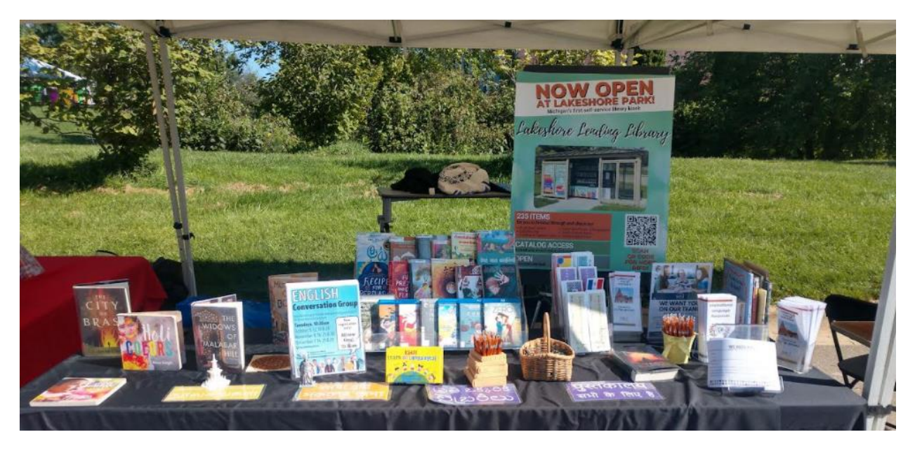
Table at Chariot Festival