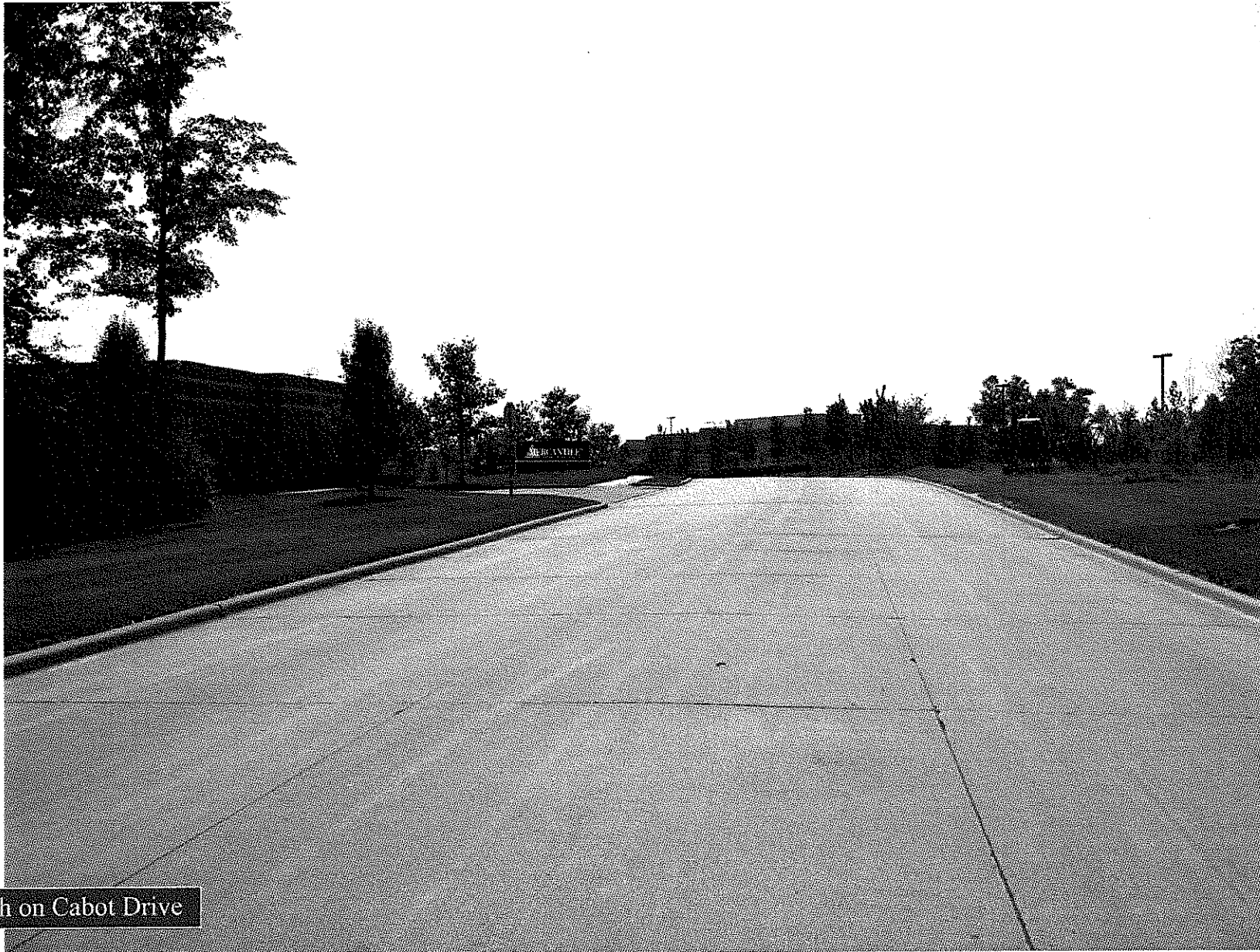
South on Cabot Drive