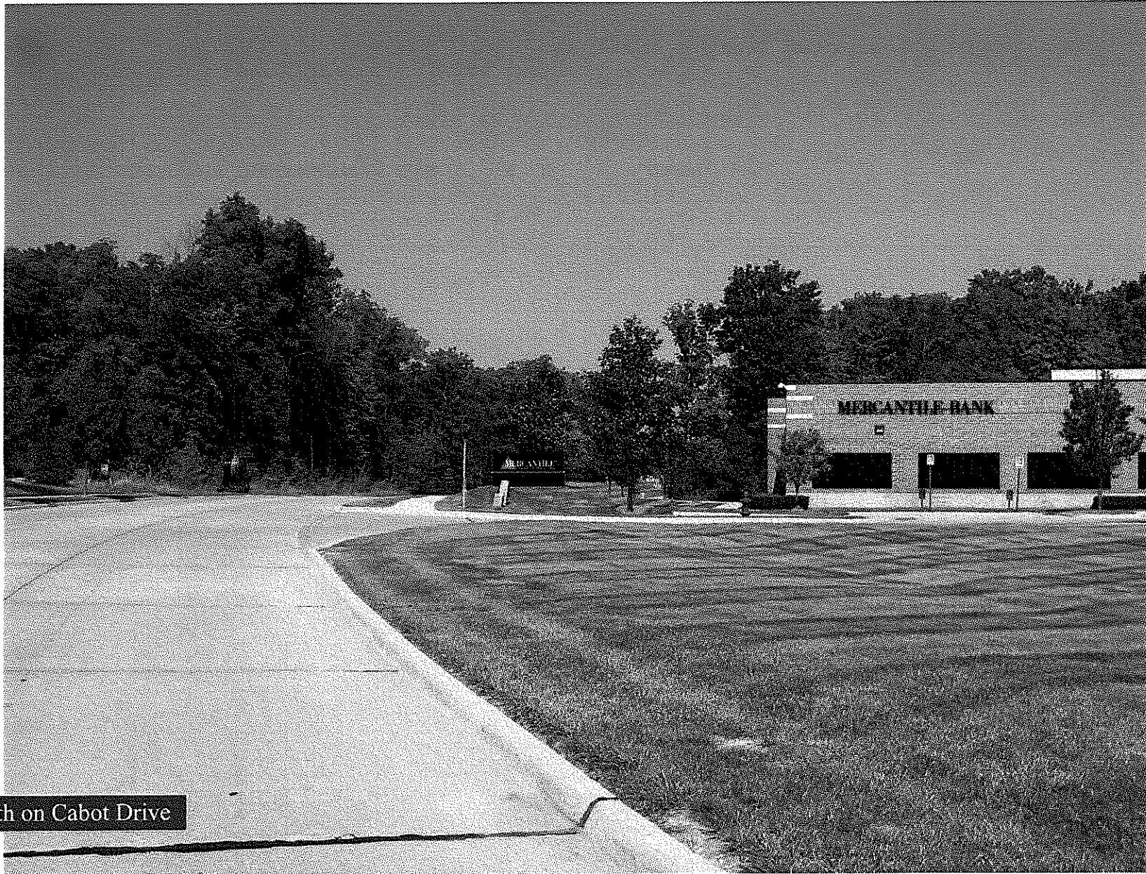
North on Cabot Drive